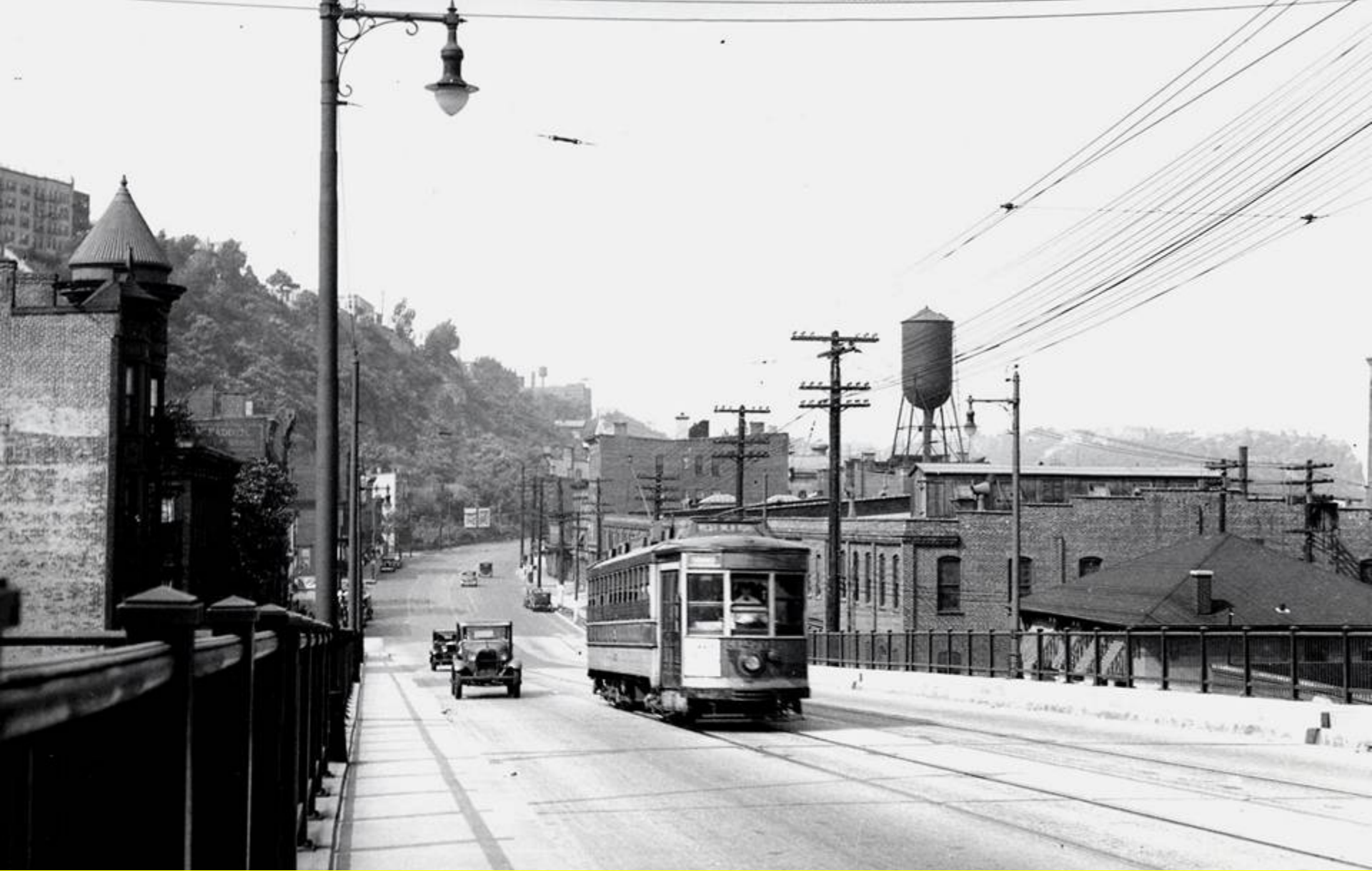
PSNJ 3270 Willow Avenue bridge August 1, 1936