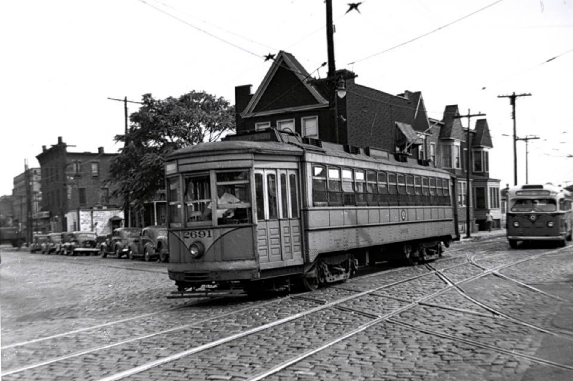
PSNJ 2691 Jackson Line Newark, NJ July 27, 1948