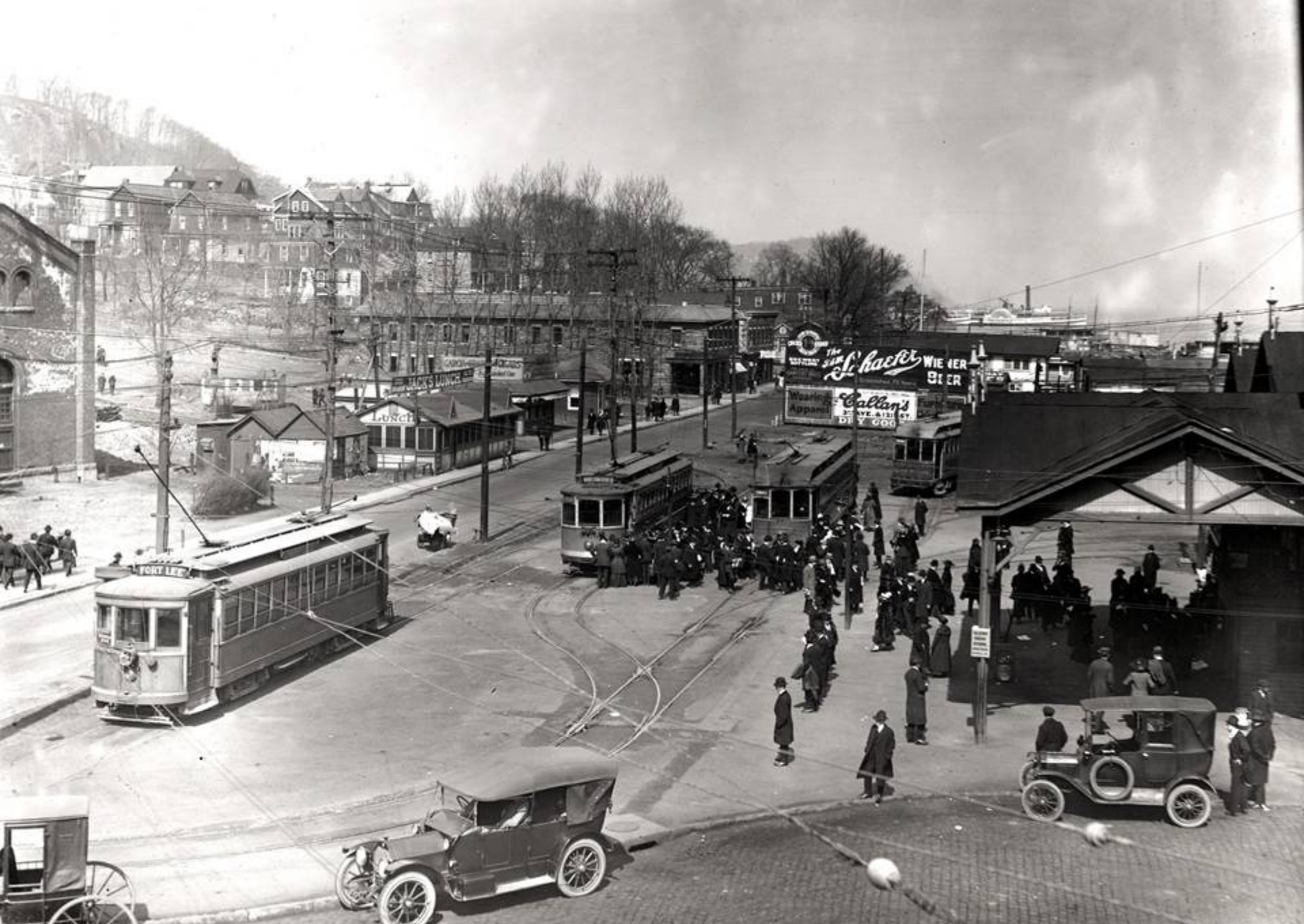
PSNJ Ferry Terminal Edgewater, NJ