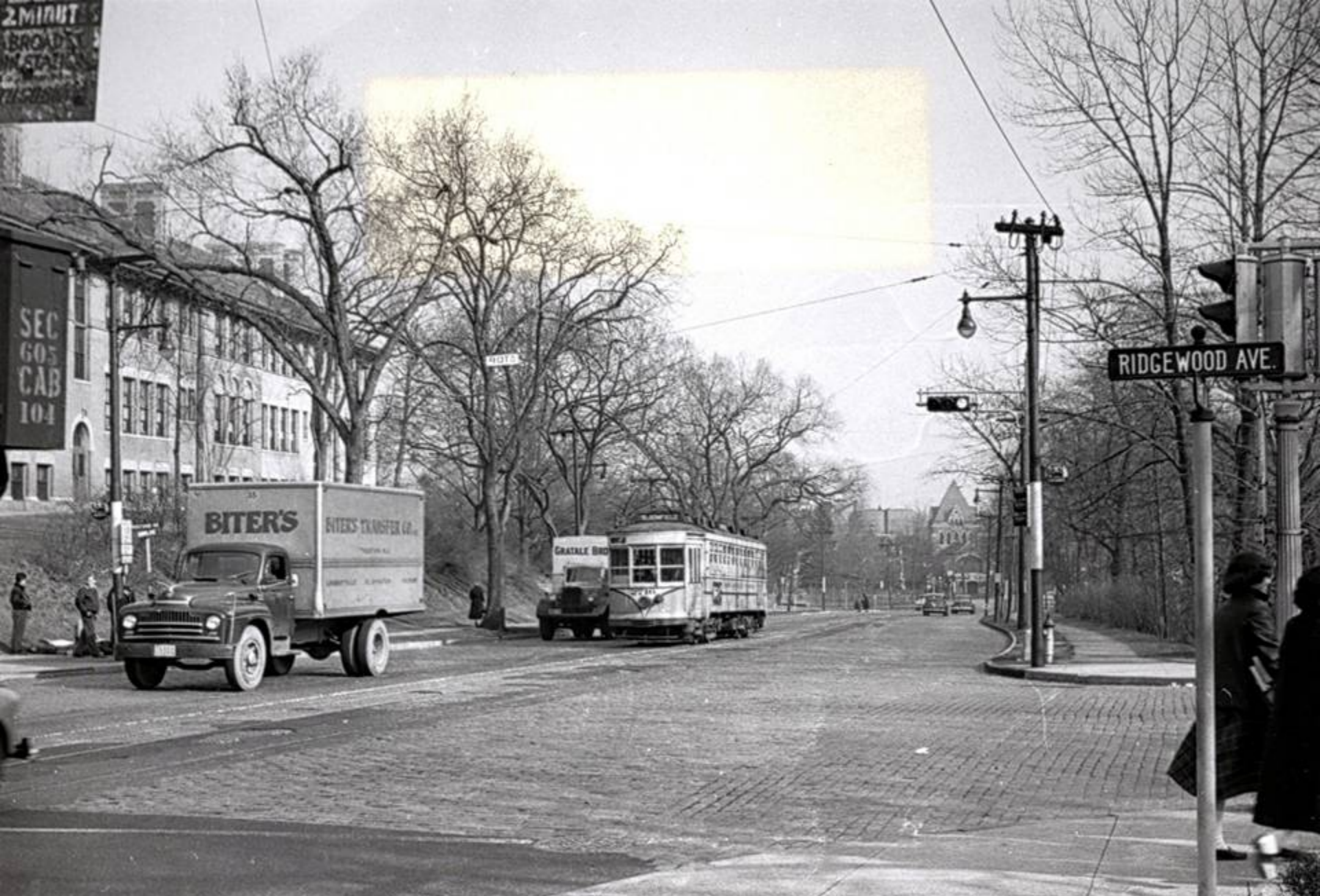
PSNJ 2716 Bloomfield and Ridgewood Aves. Flen Ridge, NJ facing east.