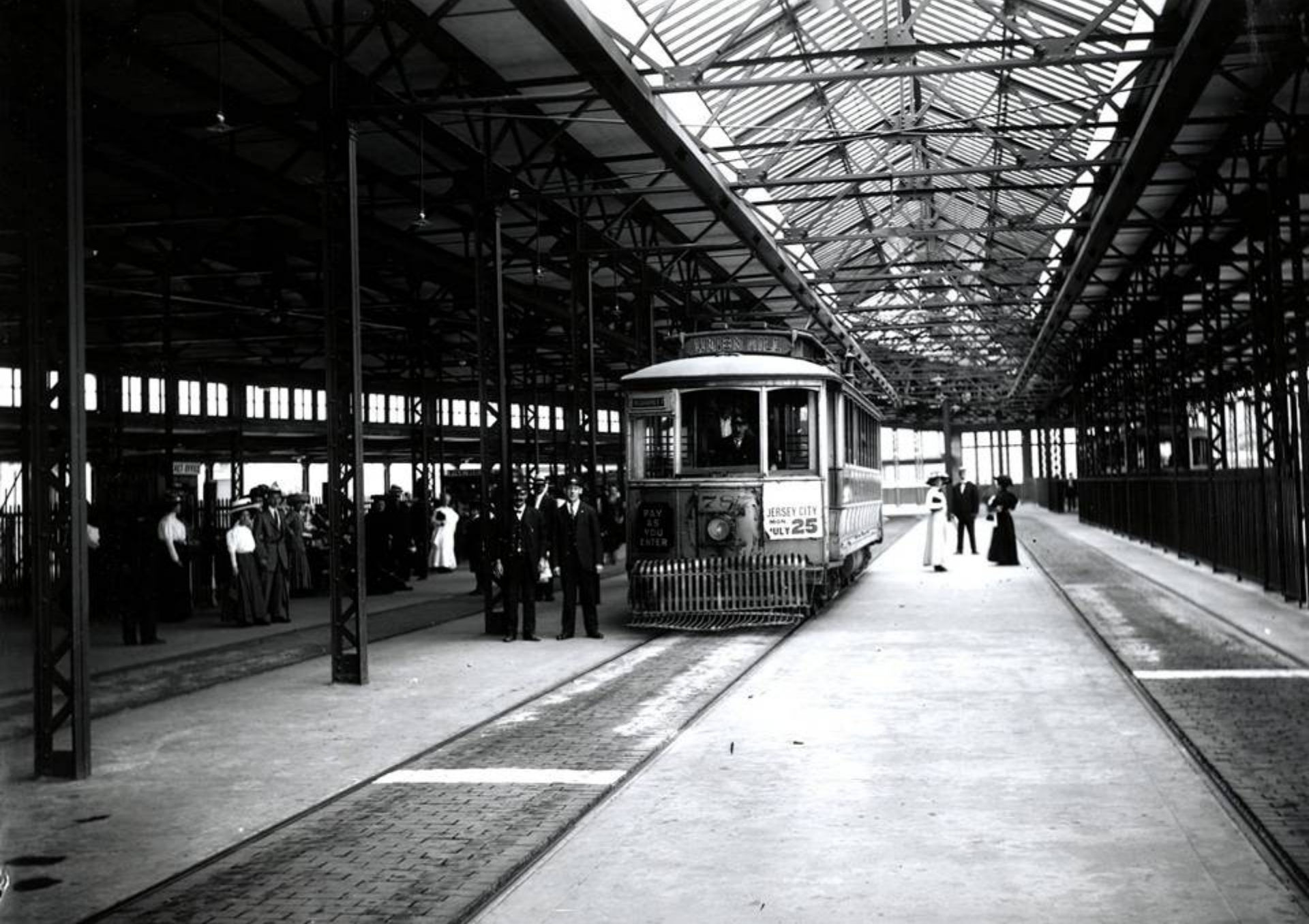
PSNJ 1787 Lackawanna Terminal Hoboken, NJ