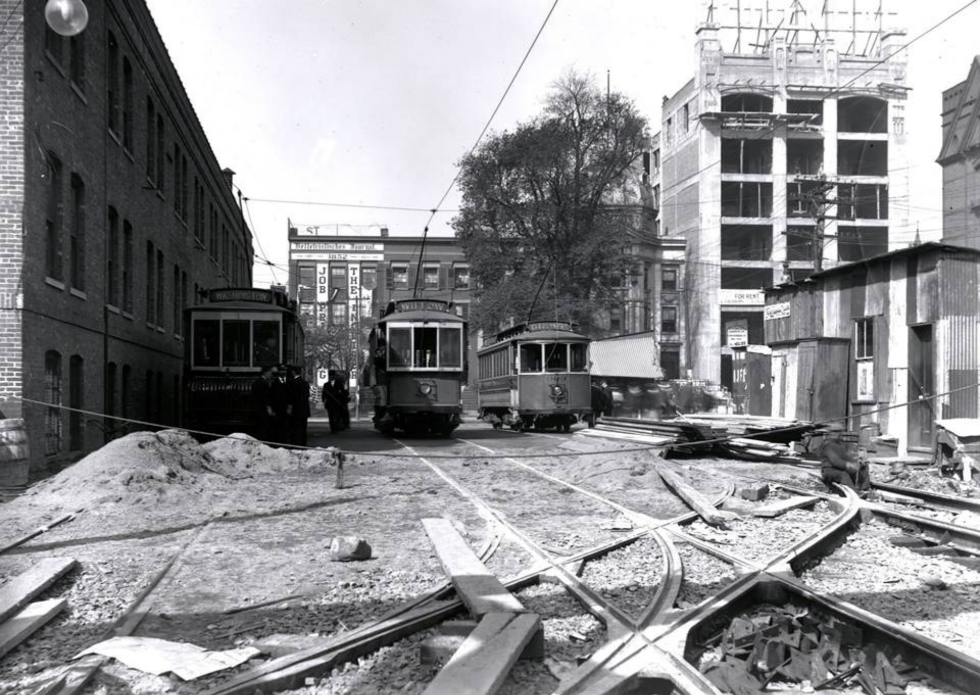
PSNJ 903, 591,701 Hudson Place Ferry Term.