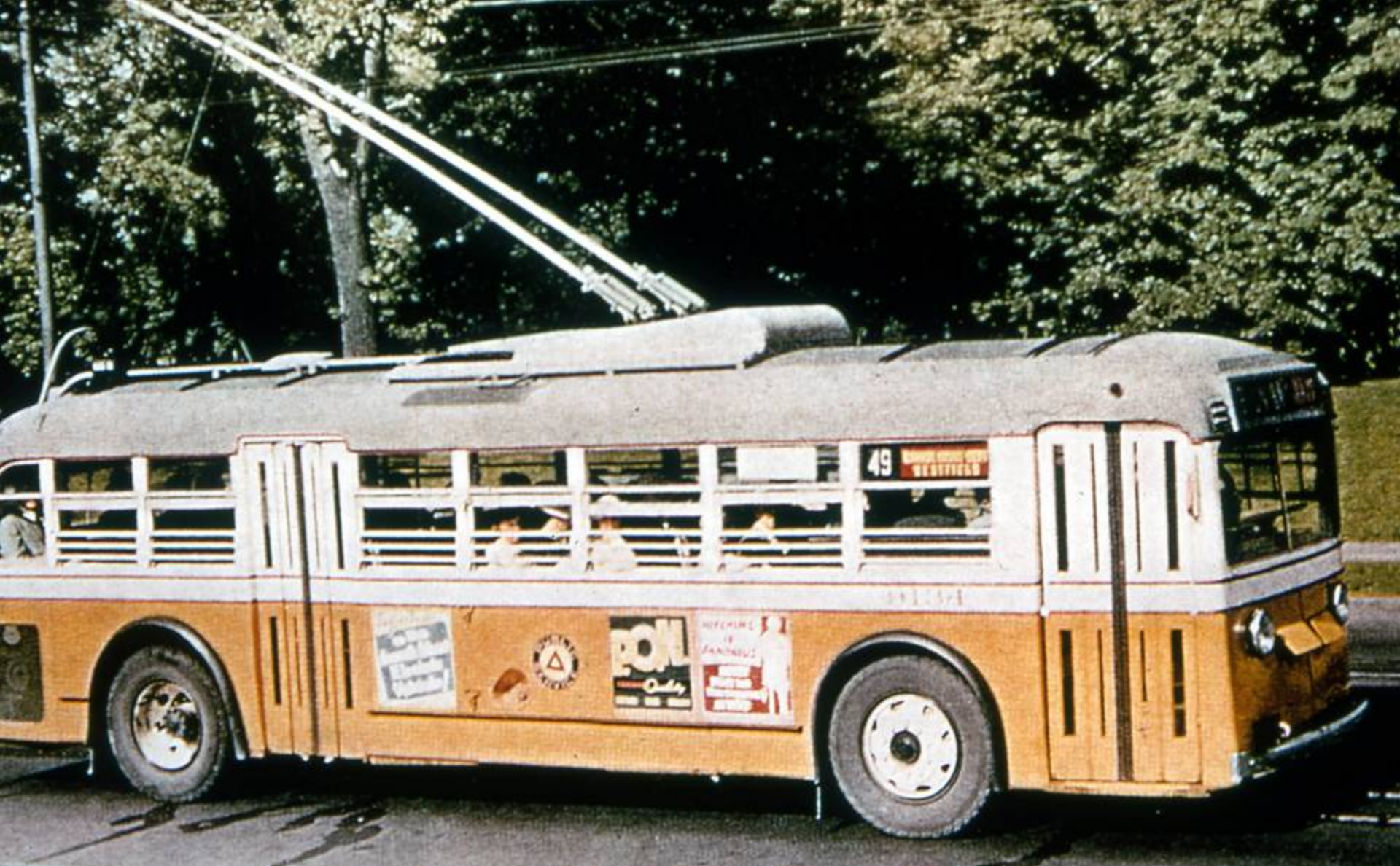
PSCT 9134 when new from Yellow Coach ca. 1937