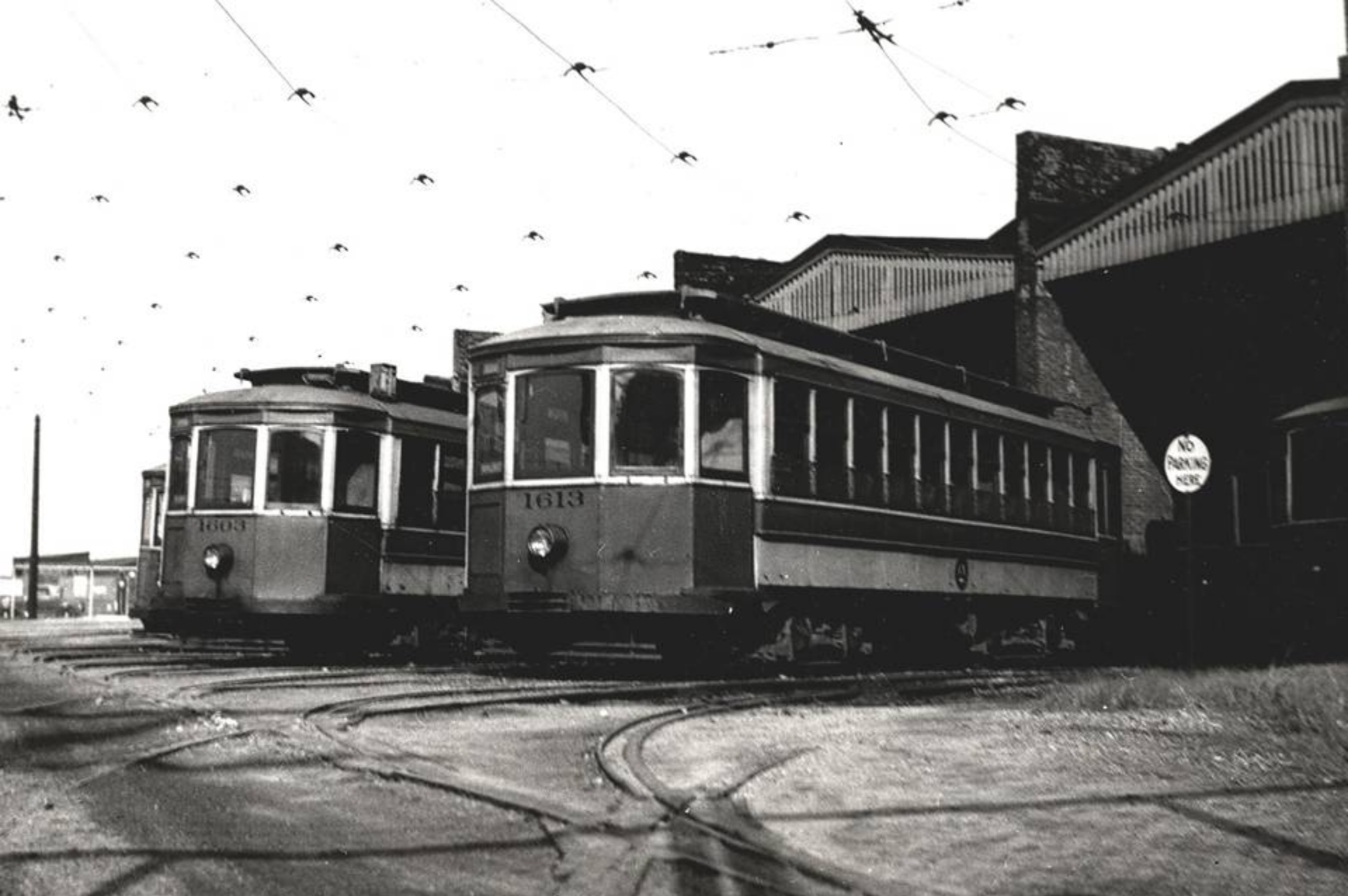
PSNJ 1613- 1603 Newark, NJ November 24, 1932