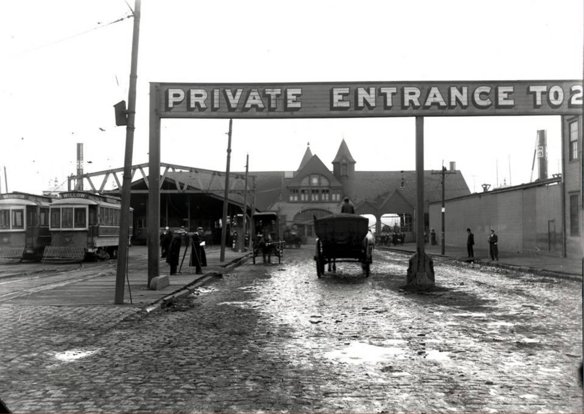
PSNJ 14th St. Ferry Willow and Washington Lines