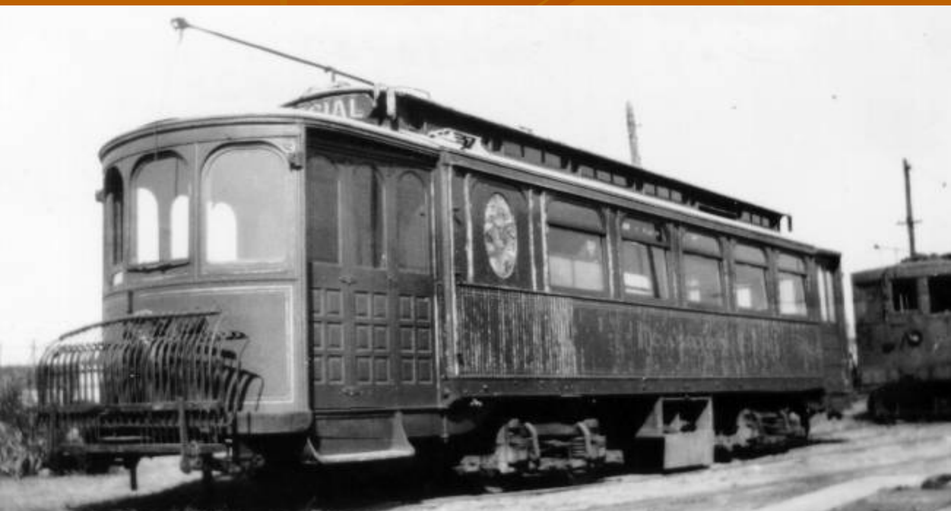
PSNJ Private Car "Camden"