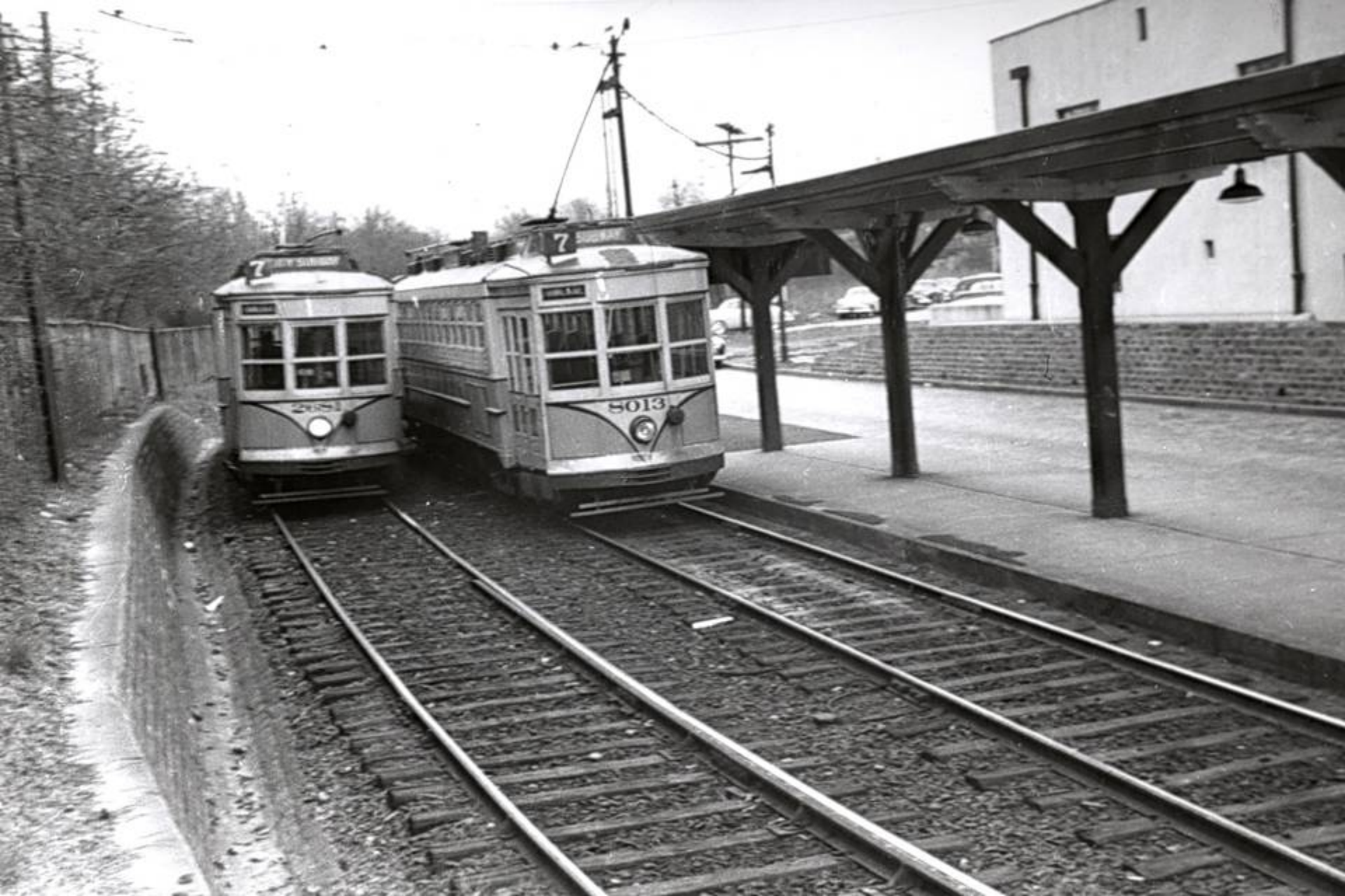
PSNJ 2681 & 8013 Franklin Ave. Terminal Newark Subway Line