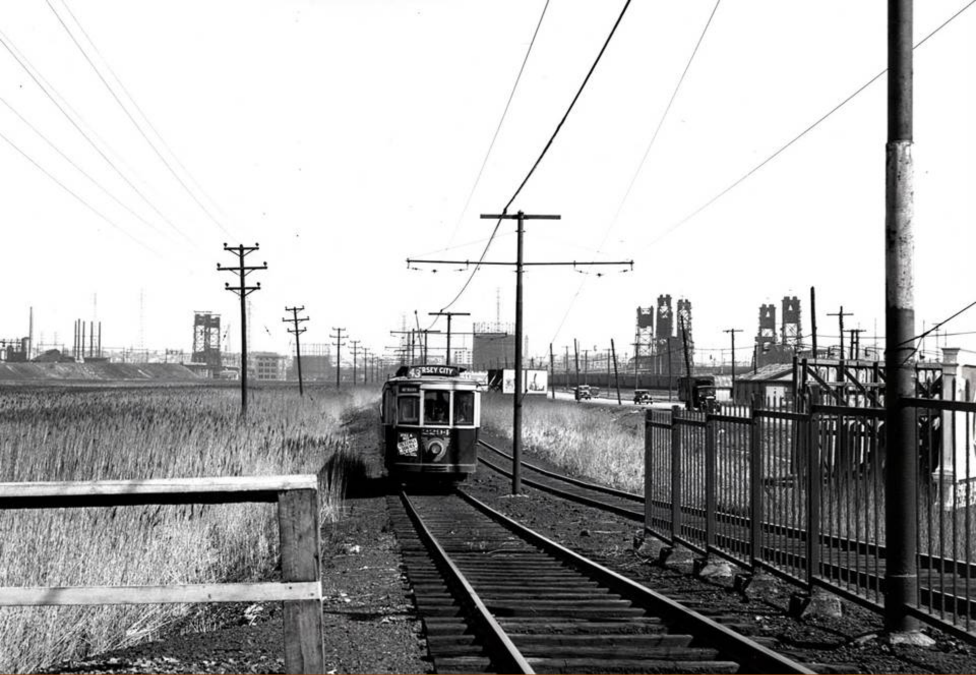
PSNJ_2204_NEAR_PRR_SHOPS_SOUTH_KEARNY_N_J_April 14, 1936 - Amazing photo - the bridges pinpoint its location along NJ 7.