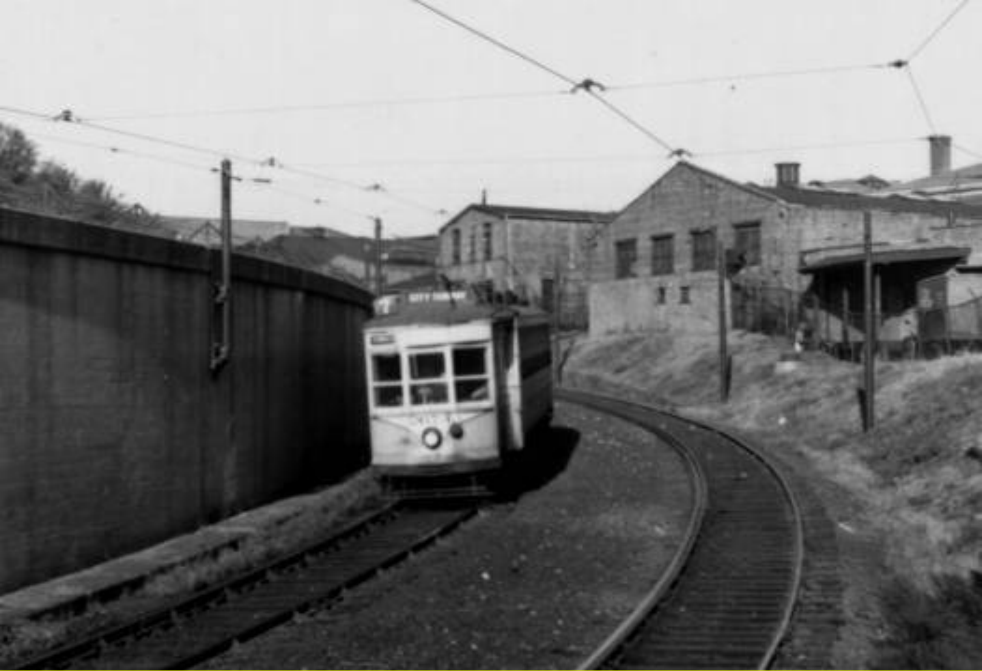
PSNJ 2674 Newark Subway Line WDV Neg. Collection