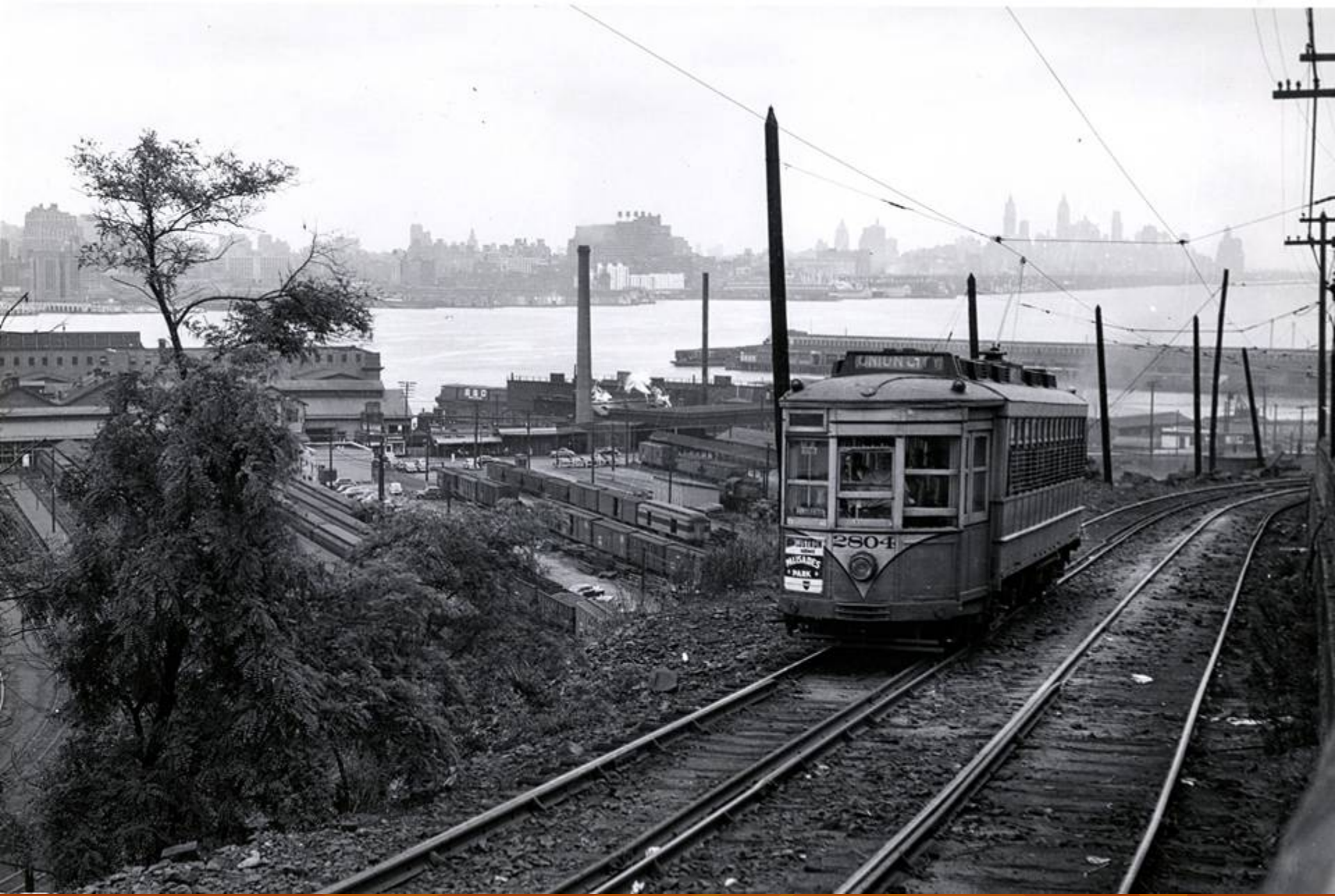
PSNJ 2804 climbing hill from Weehawken to Pershing Road Union City Line