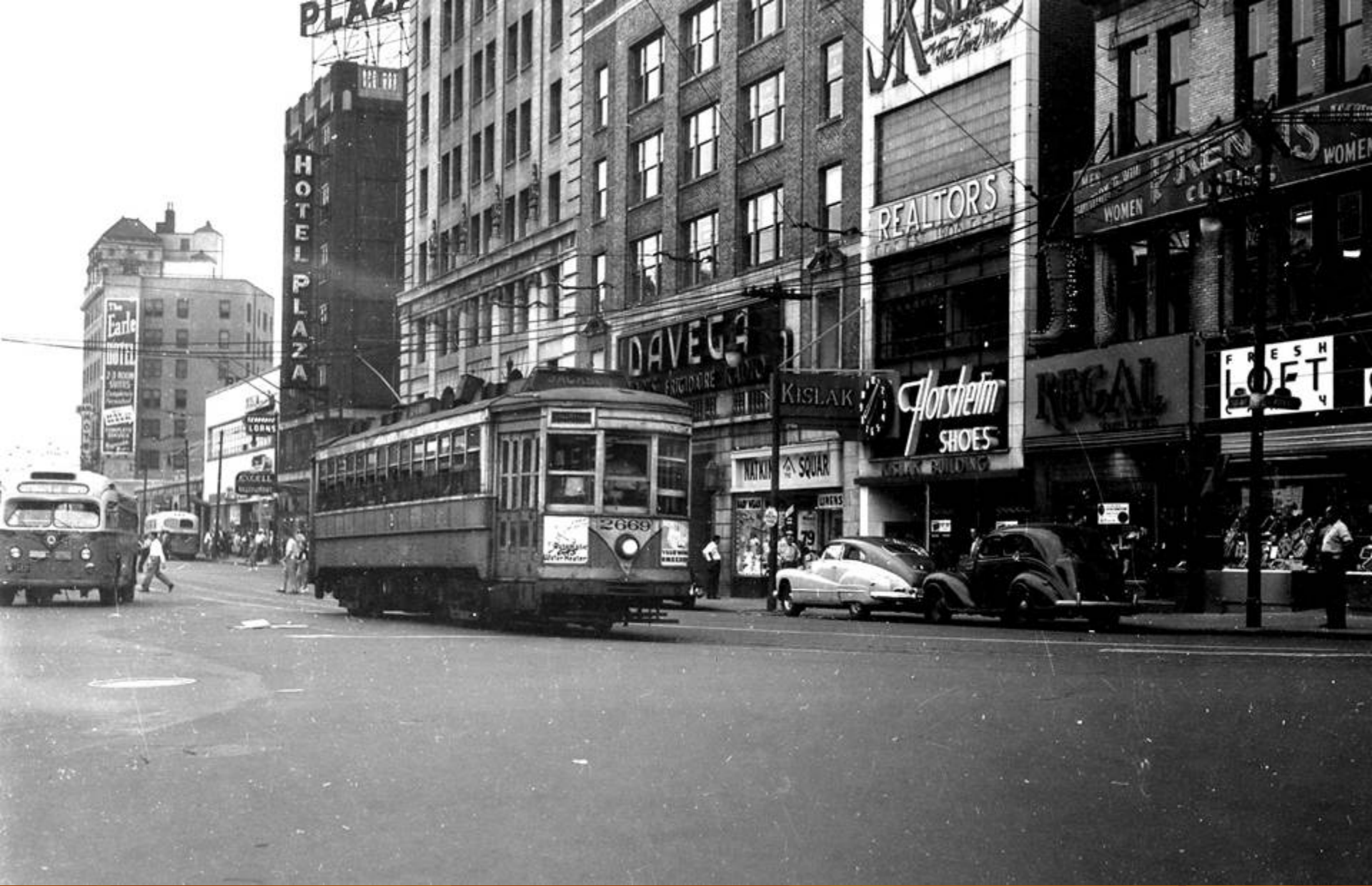
PSNJ2669 Journal Square, Jersey Ci ty, NJ August 16, 1949 Sip Avenue facing east. Jersey Journal building.