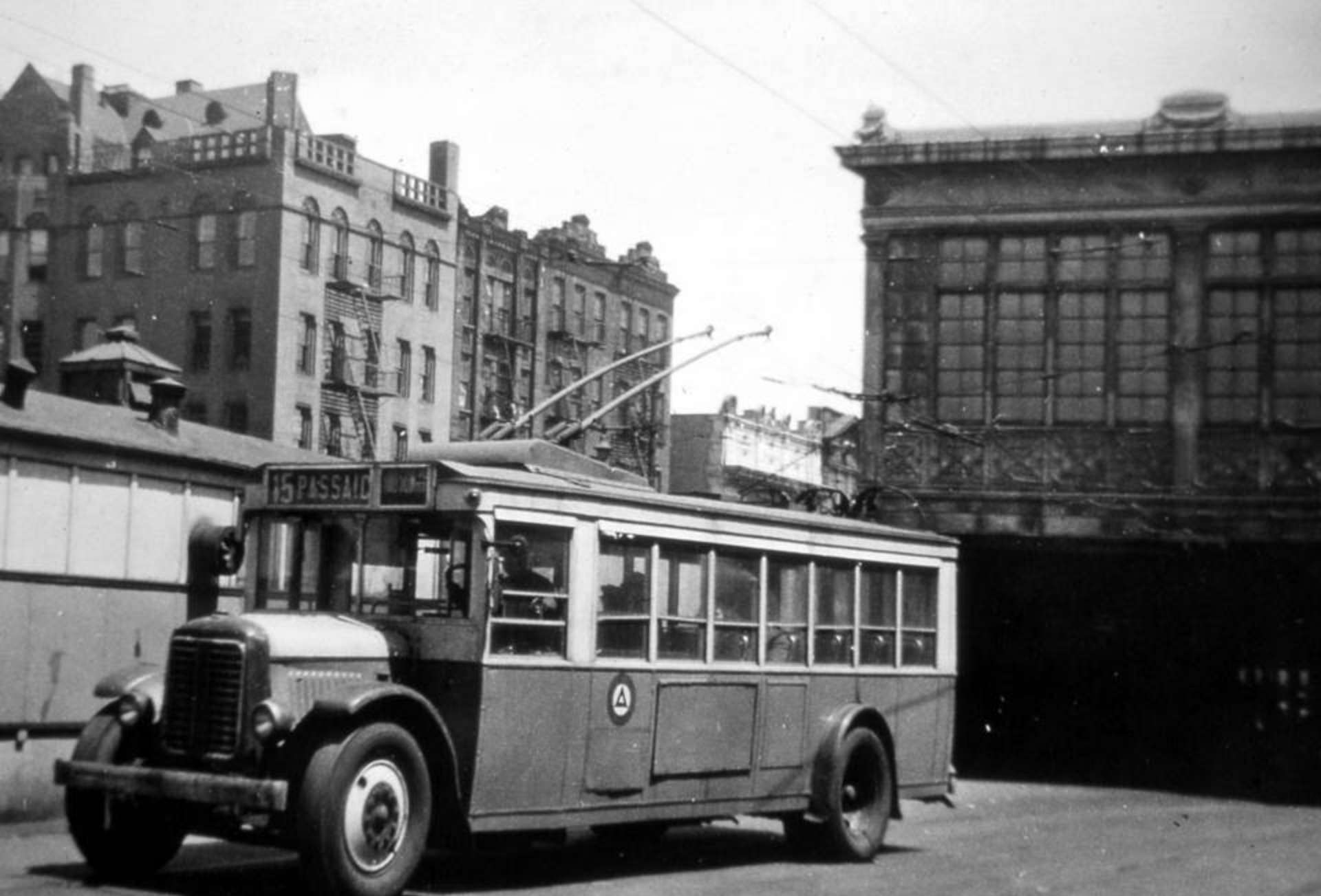
PSNJ 9821 converted from gas bus to All Service Vehicle – Hoboken Terminal