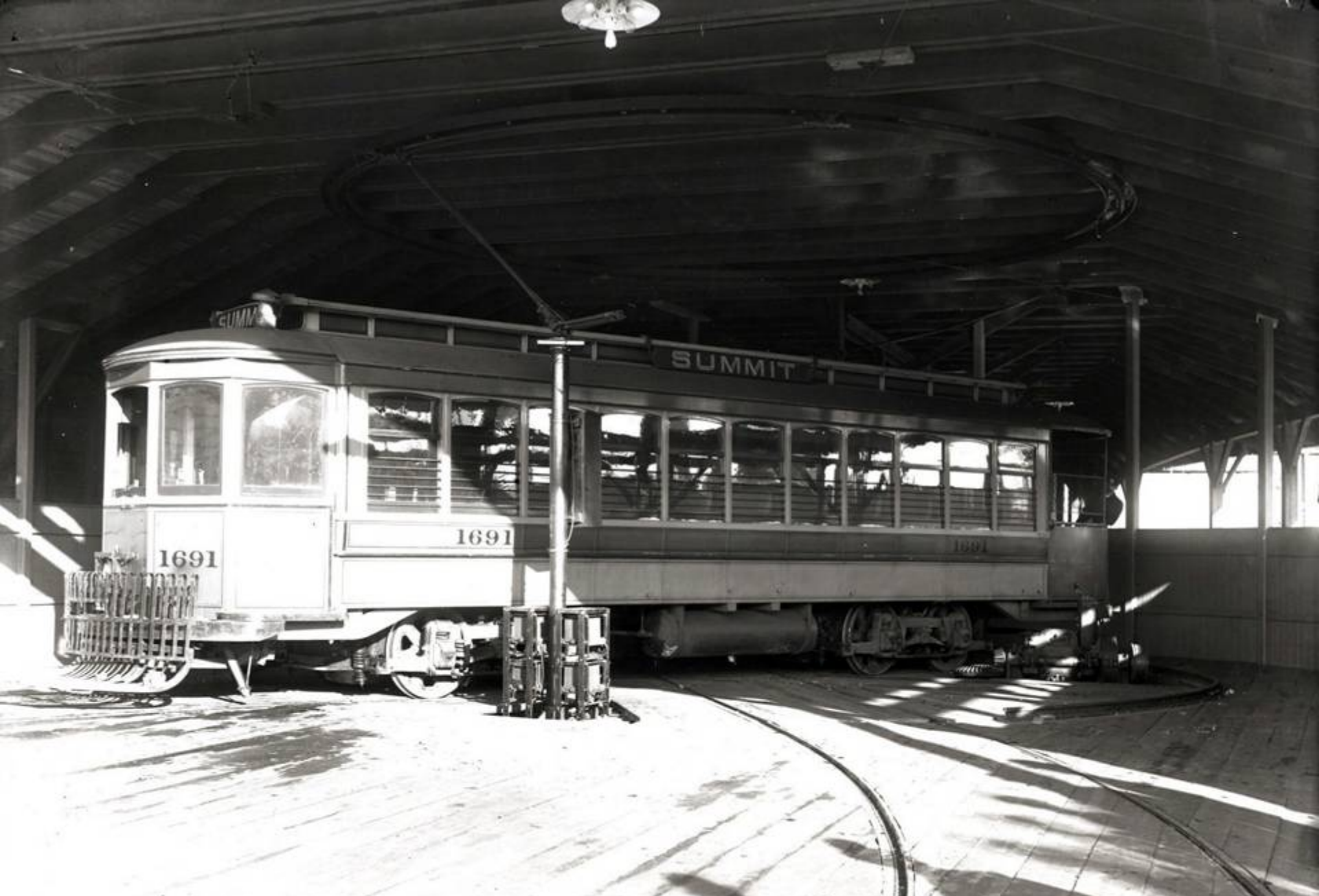
PSNJ 1691 14th St. Ferry turntable turned cars due to lack of space for loop and single end cars being used. Note overhead arrangement.