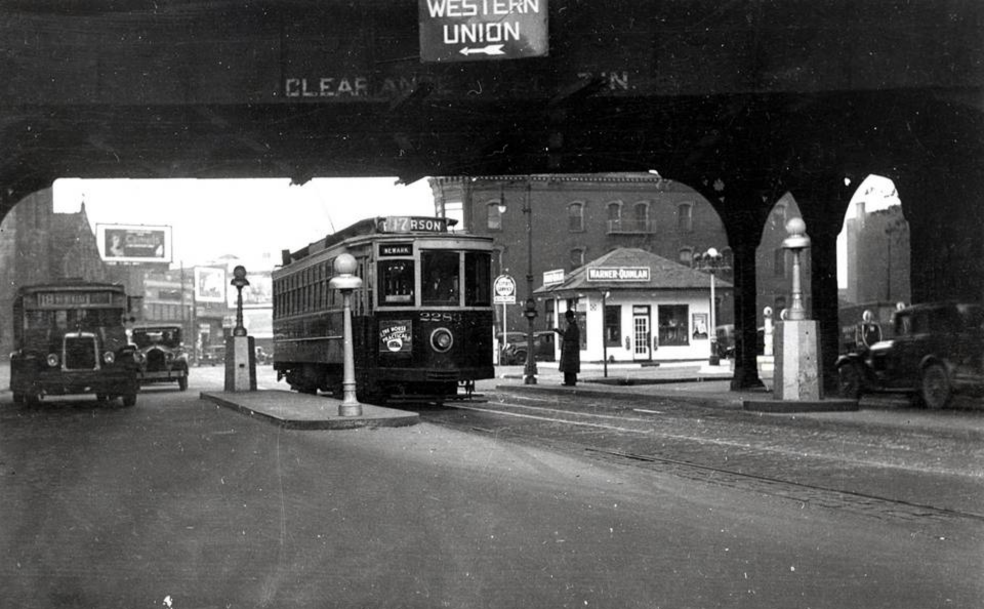
PSNJ 2283 DL&W Station, Broad Street, Newark, NJ October 24, 1936 Facing north on Broad. I-280 passes just north of RR bridge now. But, the building with the arched windows behind the Warner Quinlan building still exists, NE corner Broad & Grant.