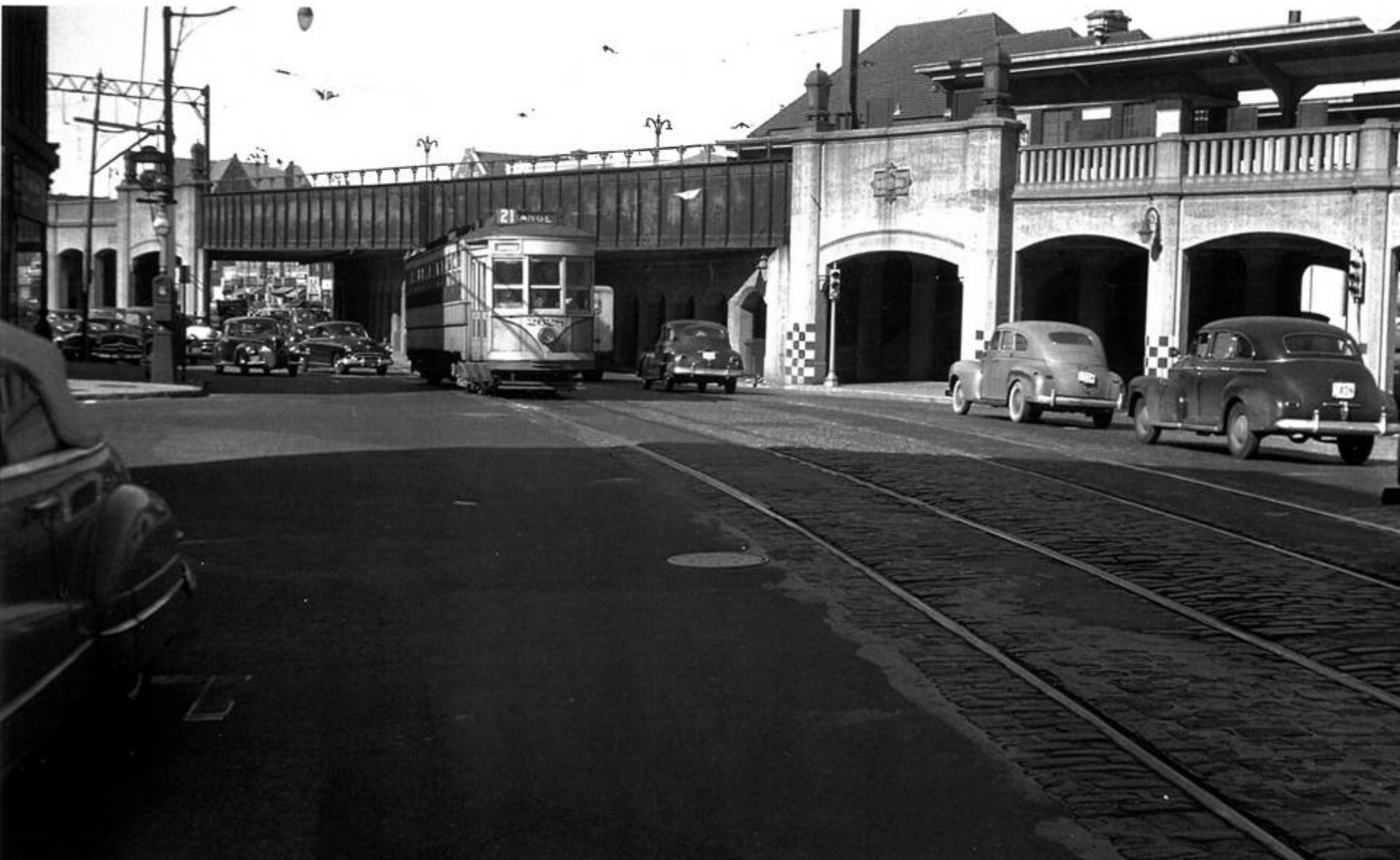
PSNJ 2625 Main Street DL&W RR Station East Orange, NJ February 27, 1951 last surface line.