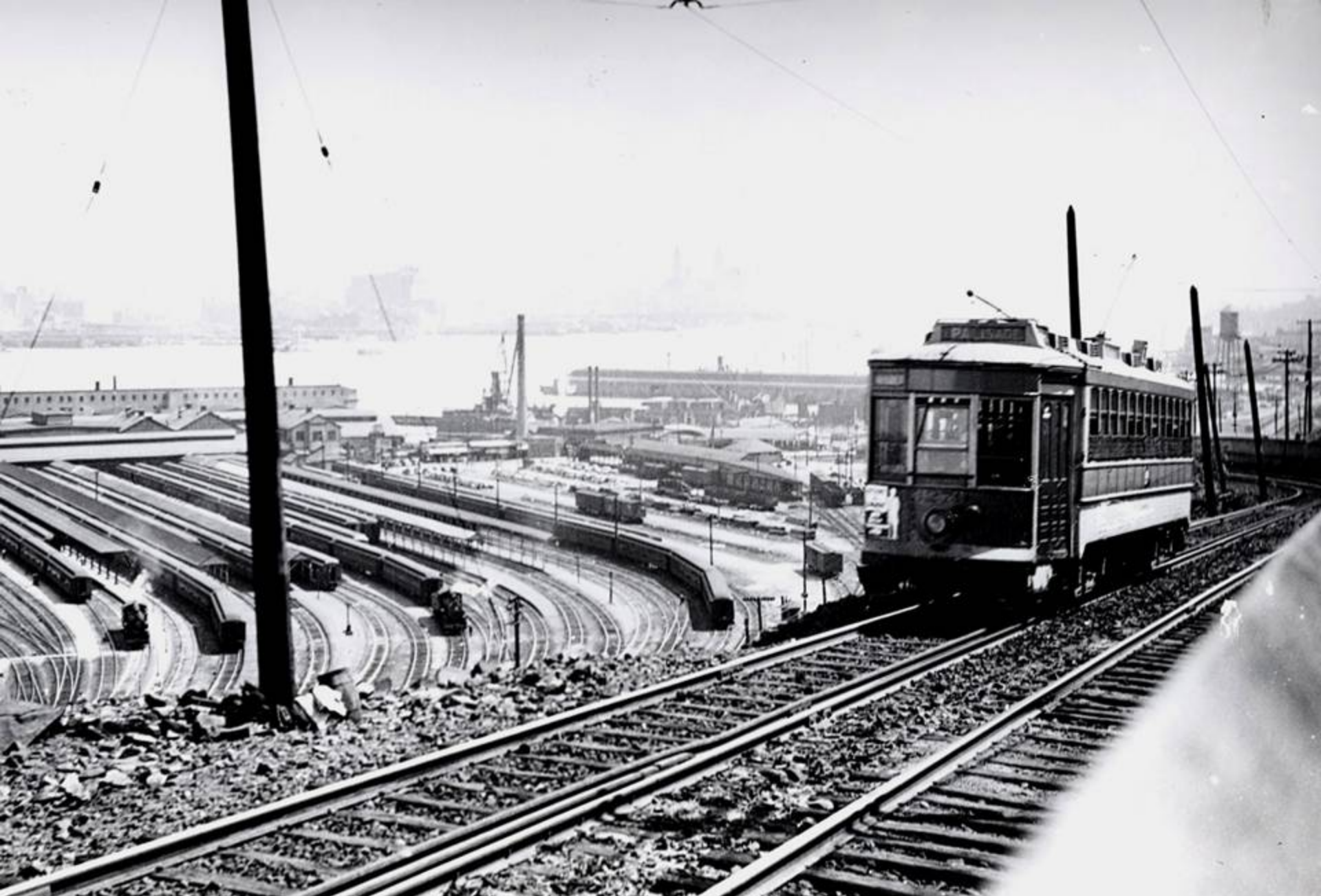
PSNJ 3279 at top of Pershing Road incline overlooking the NYC West Shore Line Weehawken Terminal ca. 1935