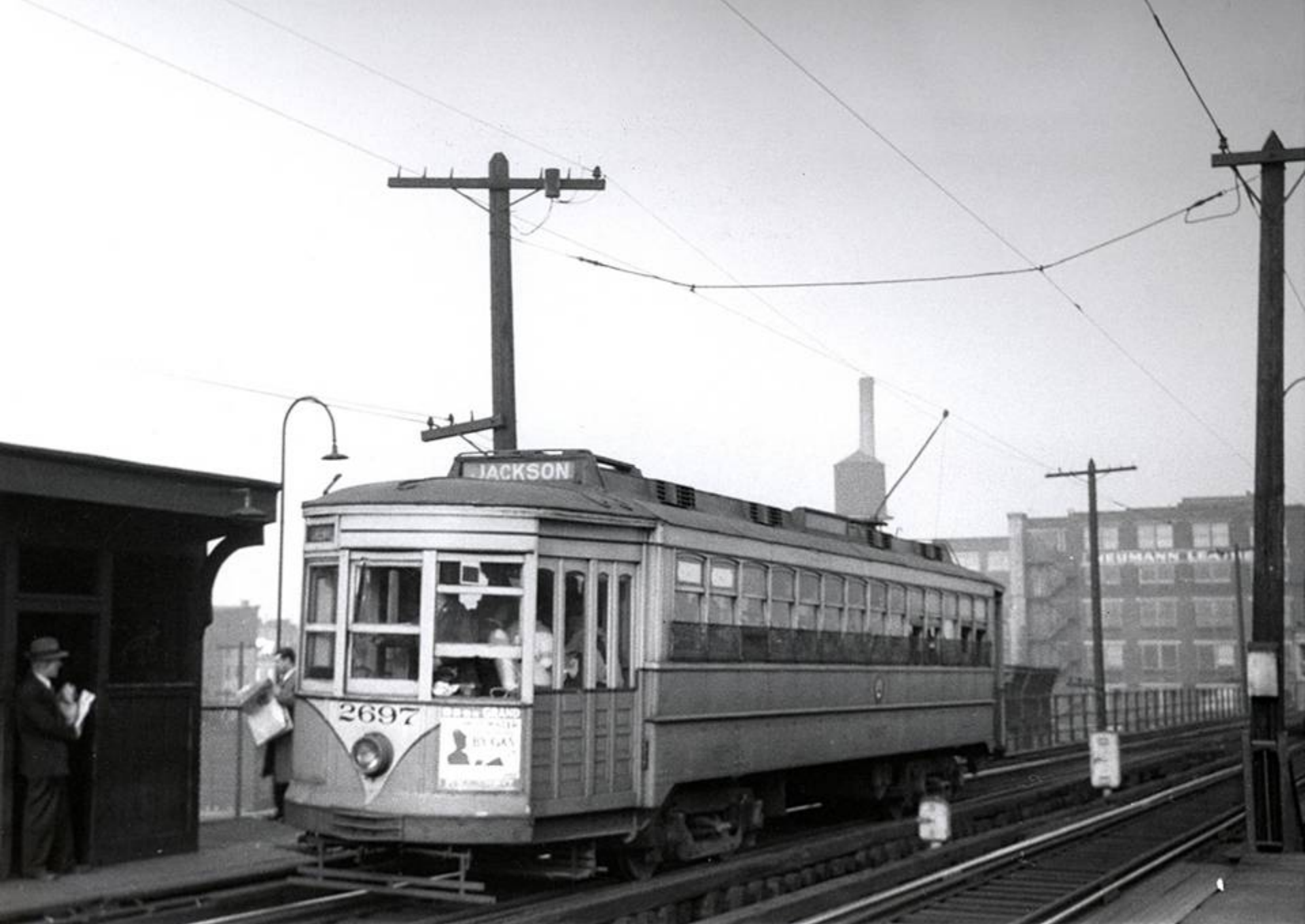
PSNJ 2697 on Hoboken elevated line