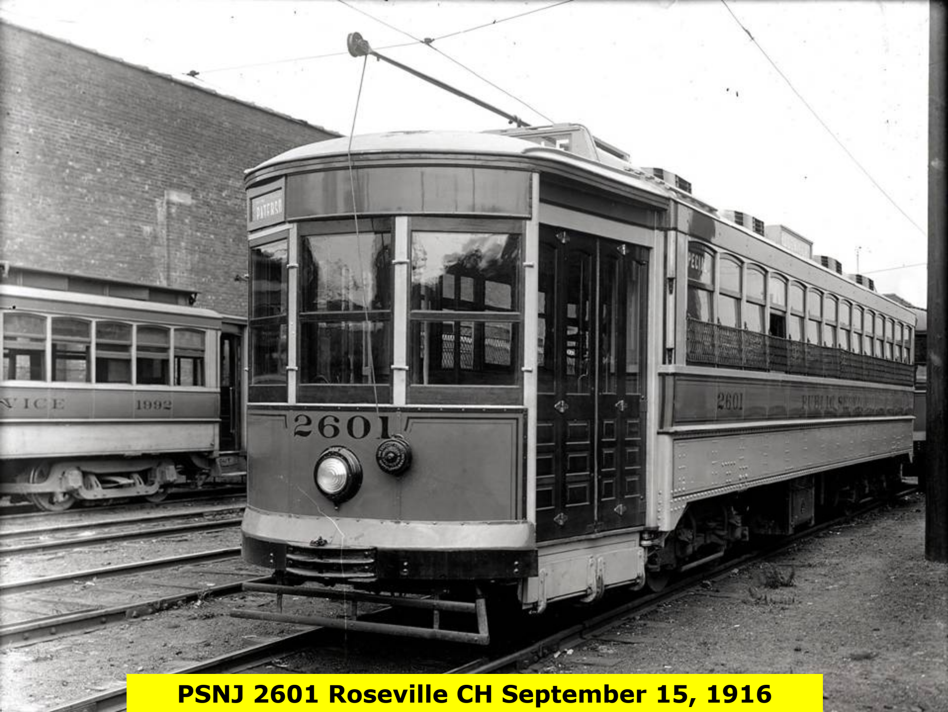
PSNJ 2601 Roseville CH September 15, 1916