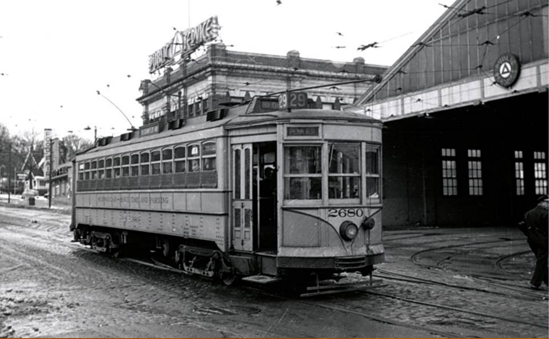
PSNJ 2680 Montclair CH March 22, 1952 Bloomfield Ave & Bell St. facing west - Public Service building still exists. Food Fair is now a Whole Foods - the Food Fair tower sign reused! Carhouse itself is gone.