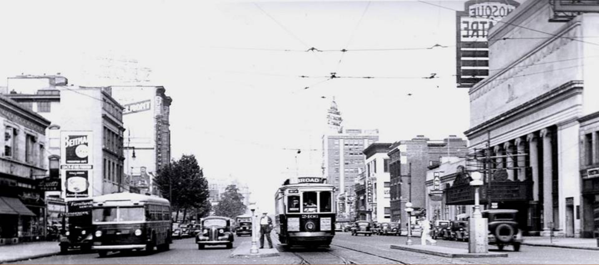
PSNJ 2416 Broad Street South Clinton Ave., Newark, NJ September 4, 1937 facing north on Broad. Newark Symphony Hall at right.