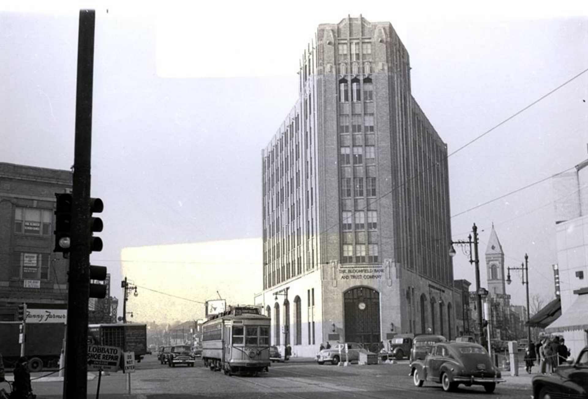
PSNJ 2725 Bloomfield Ave. Caldwell, NJ Corner of Bloomfield and Broad.