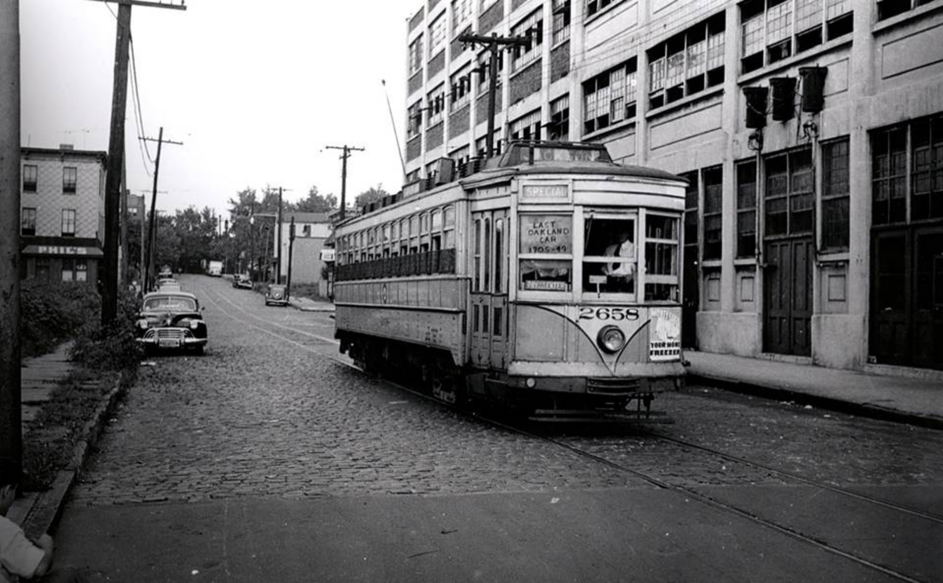
PSNJ 2658 Last Oakland Car, May 17, 1949 - Oakland Ave. Jersey City facing north from about mid-block between Laidlaw & Jefferson. The warehouses still exist, but most of the windows have been bricked over.