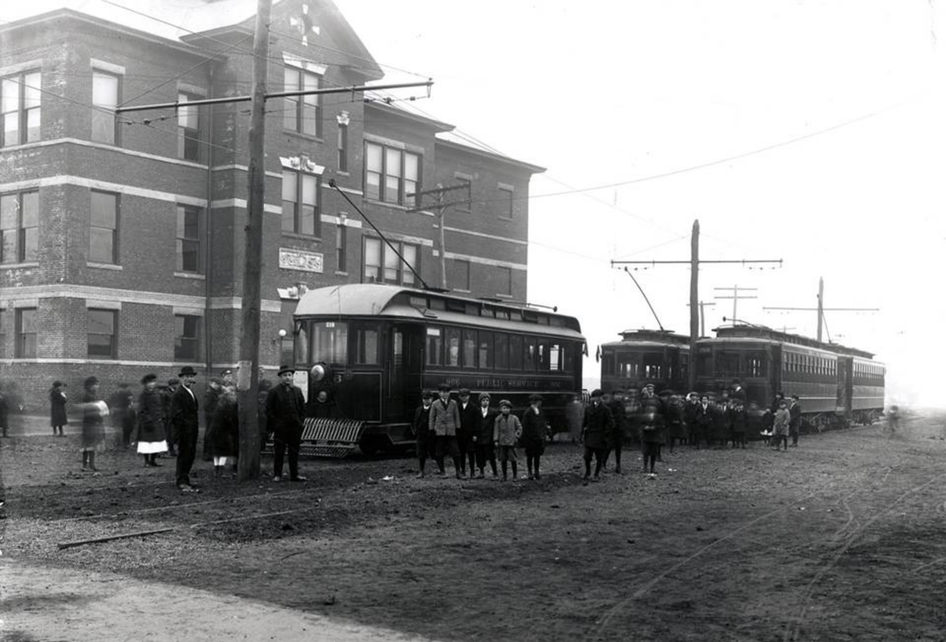
PSNJ 966 3533 3523 Carteret, NJ Chrome Ave Line December 18, 1915