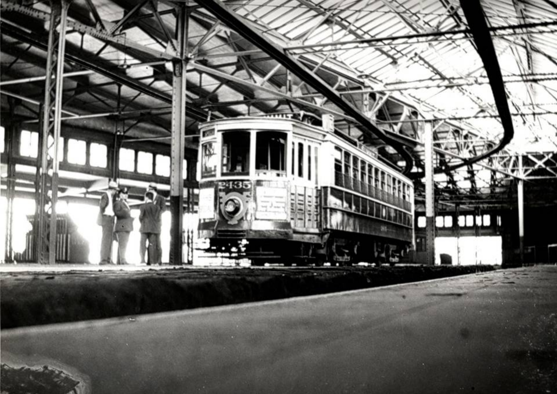
PSNJ 2435 Hudson Place Ferry Terminal