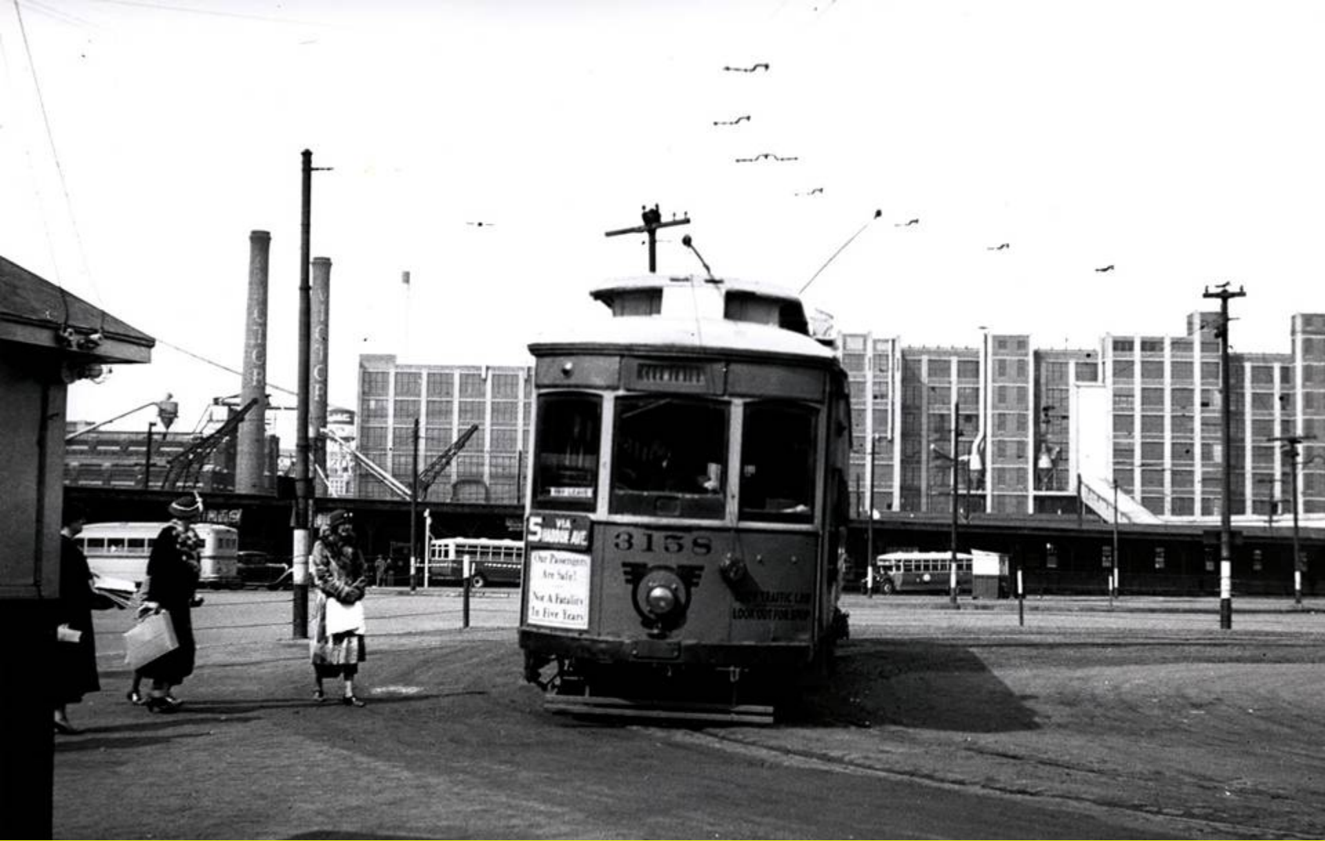
PSNJ 3158 Ferry Terminal Camden, NJ Campbell Soup plant in background. April 6, 1935