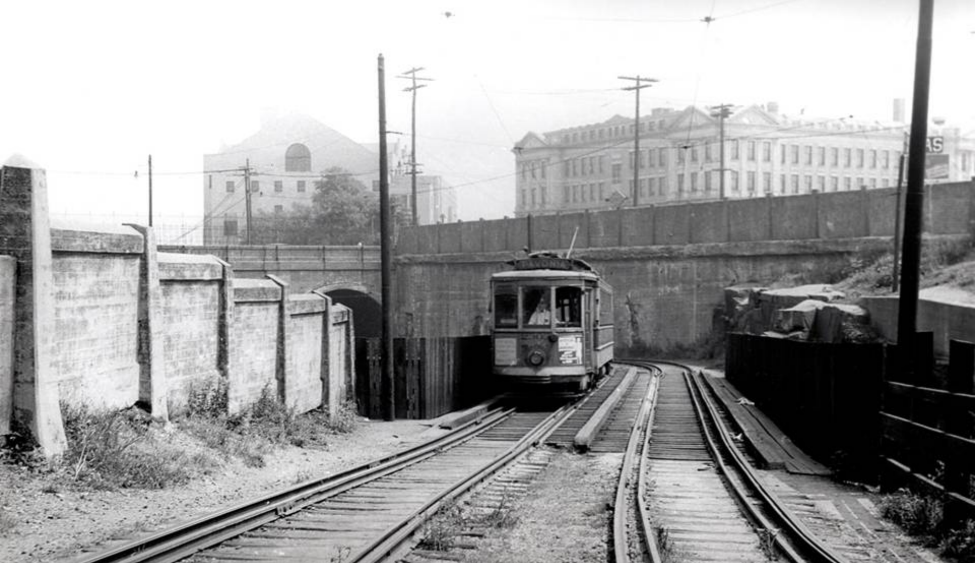
PSNJ 2303 On Bridge over Erie RR Jersey City, NJ ca. 1936 – Another great view. Trolley car is crossing Erie Bergen Arches. View is s.w. from 139 State Hwy- Dickinson HS in rear. The area is overgrown by trees now, but online aerial photos clearly show the small arch for the trolley line and the concrete retaining wall. Very interested to find out if that bridge is still there down in the weeds and trees.