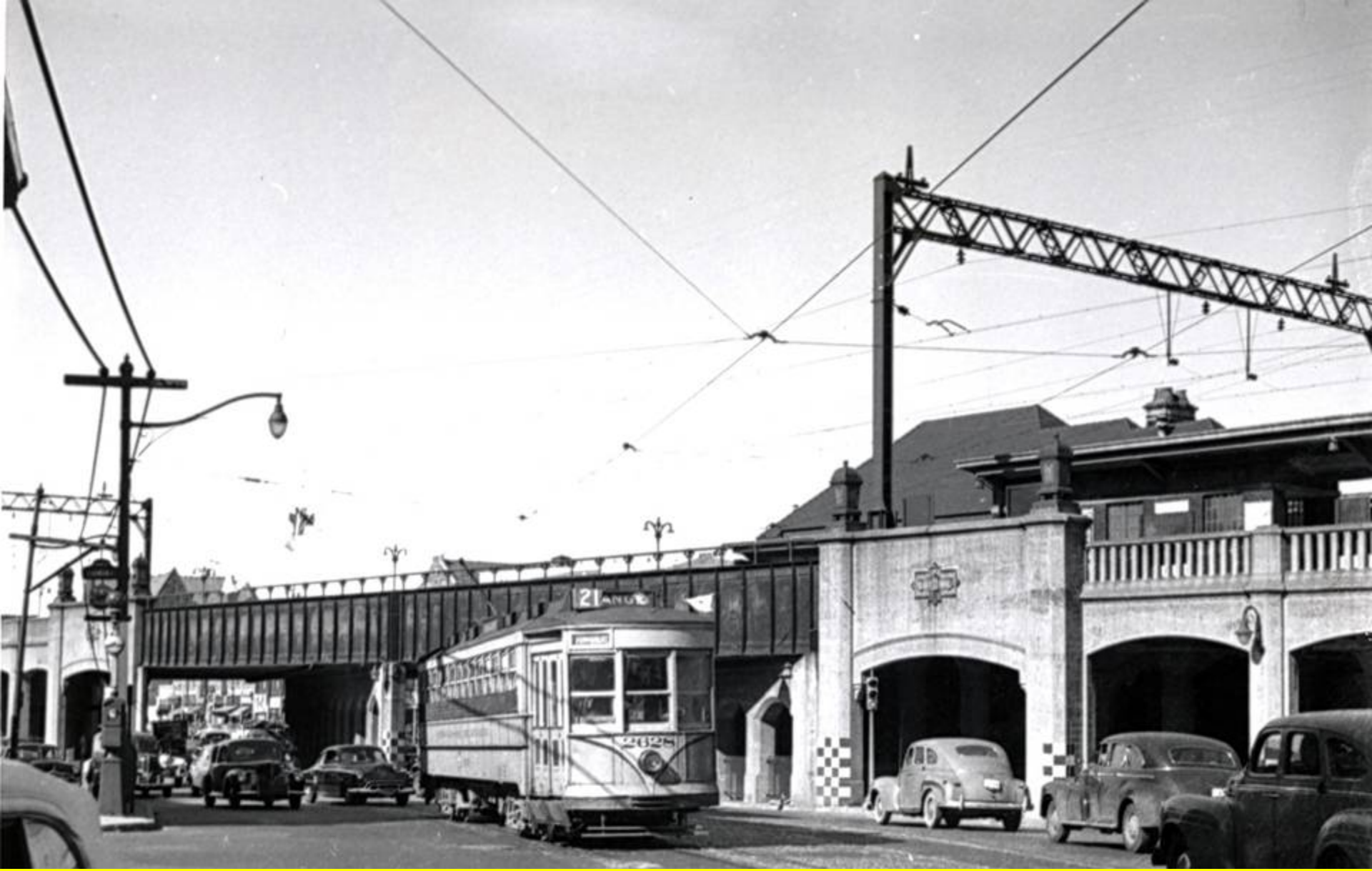
PSNJ 2628 Main Street passing East Orange, NJ DL&W passenger station.- Standing on whatwas Main St (now MLK Jr Blvd) facing n.w. I-280 runs left to right exactly on this spot now, but the train station remains intact.