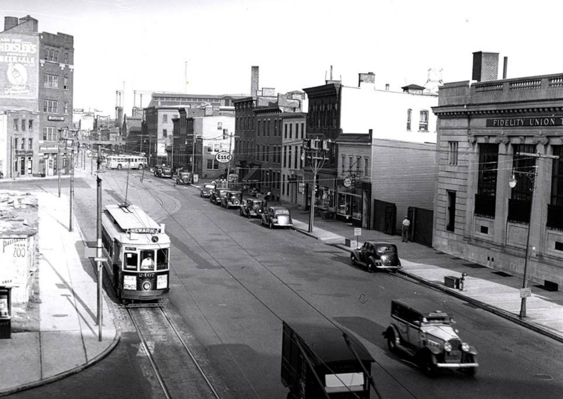
PSNJ 2467 Market St. Newark, NJ near Penn Station July 30, 1937