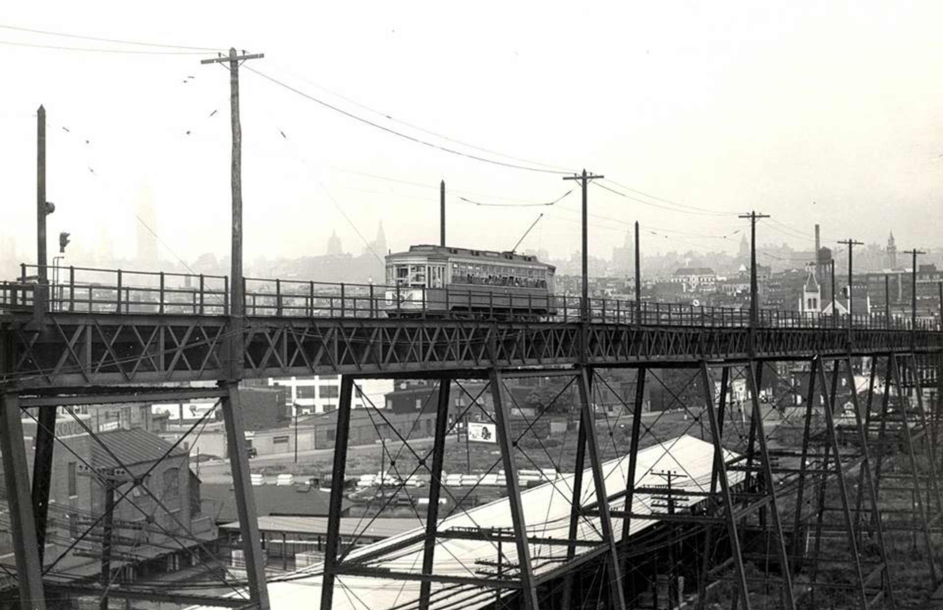
PSNJ 2747 CLIMBING JERSEY CITY TRESTLE August 6, 1949, the location is mostly self explanatory, but to point out there's a church with a white stone steeple at right - that is on corner of Monroe & Observer Hwy. right across from my house. I can see it from my window. The Hoboken terminal clock tower is in the distance at very right