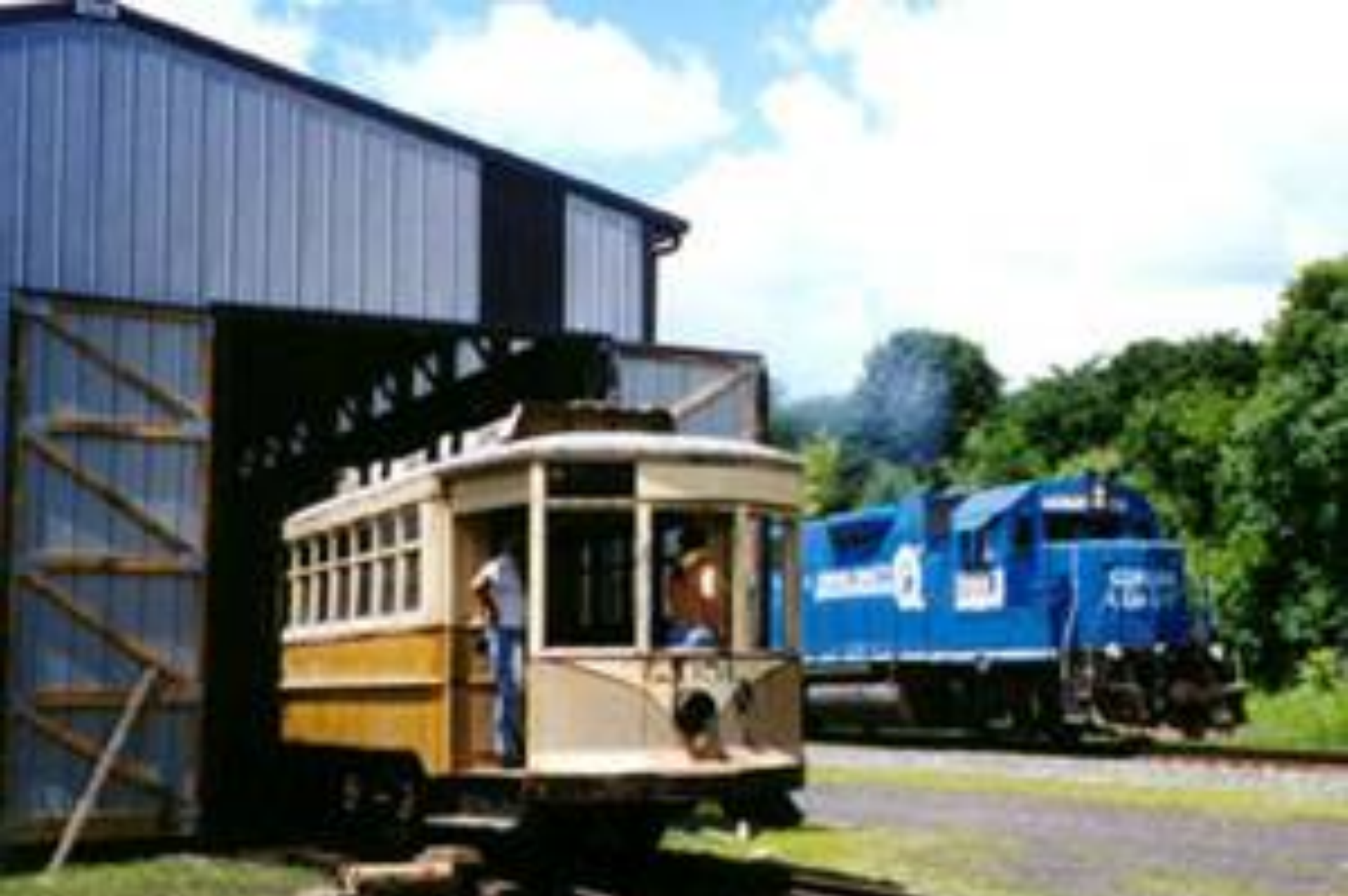
PSNJ 2651 being preserved at Ringos, NJ