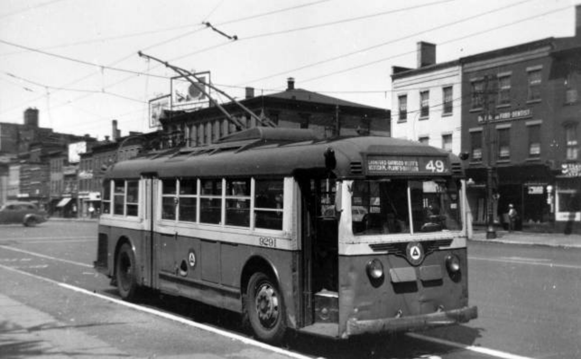
PSNJ 9291 on Rt.-49