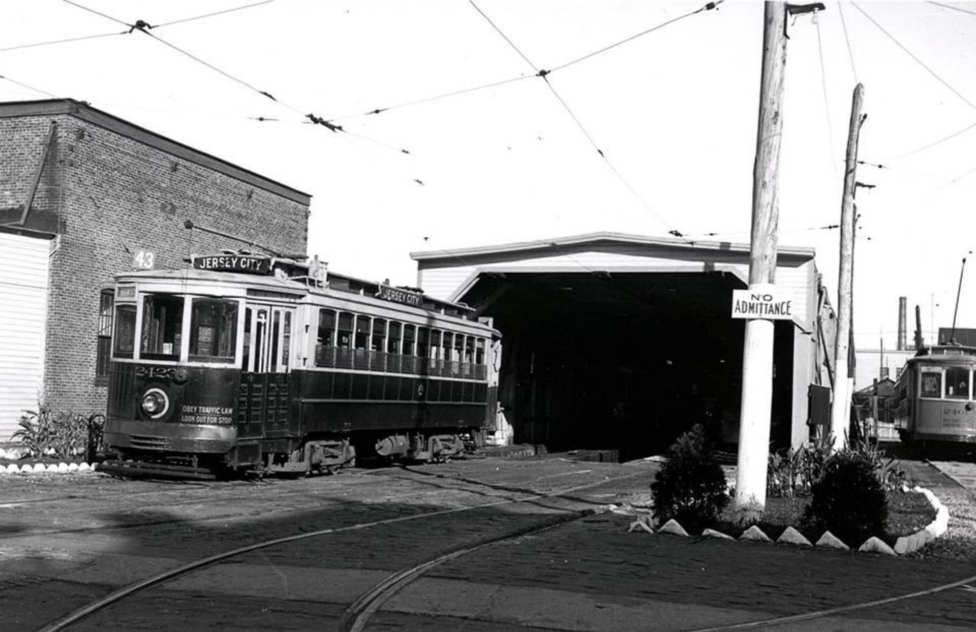
PSNJ 2423 Harrison Car Yard, Harrison, NJ. November 2, 1934 Think this is on Harrison Ave near 5th where a big school is now.