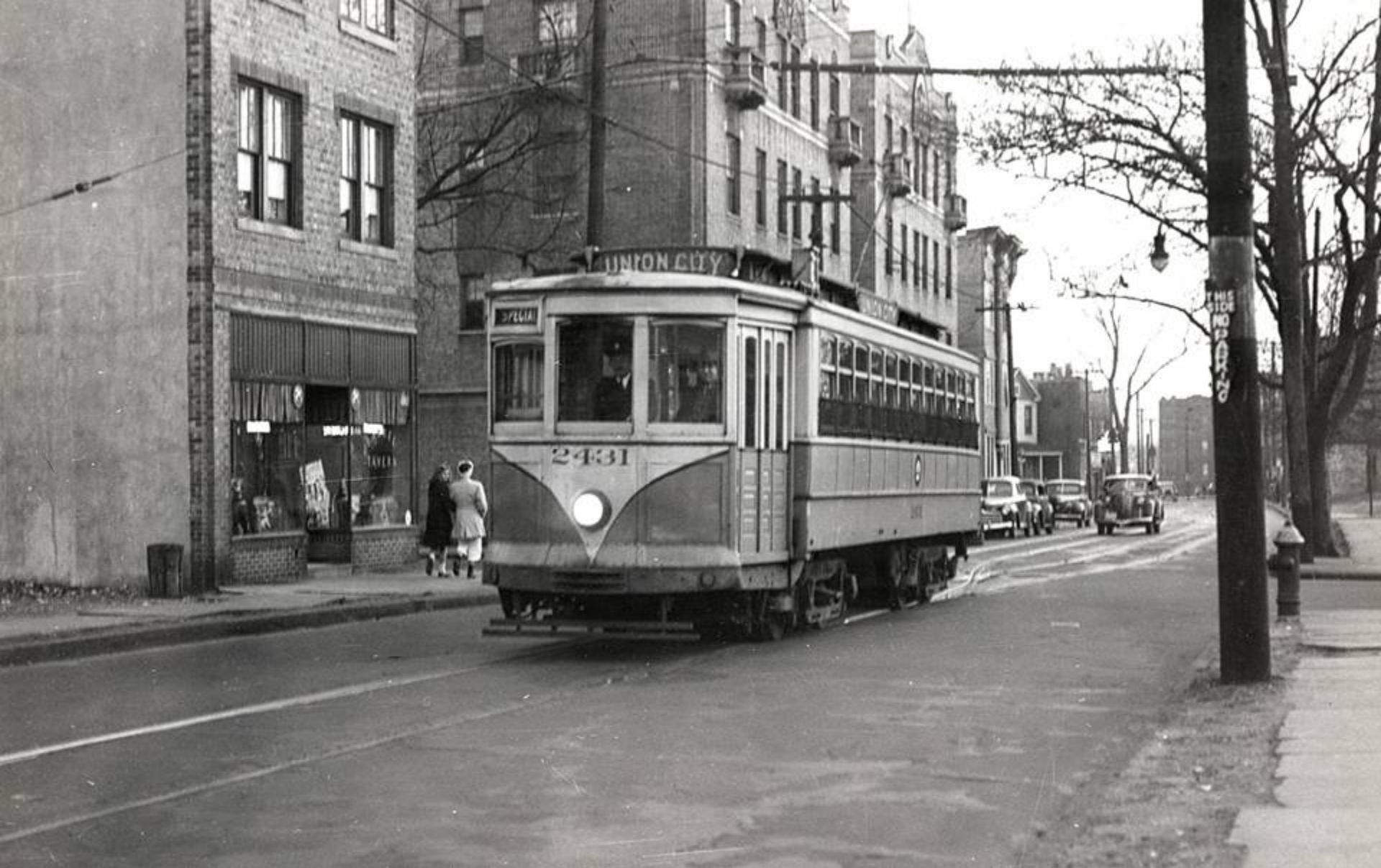
PSNJ 2431 Old Bergen Road Jersey City, NJ April 10, 1947 - Old Bergen & Bartholdi looking south - Greenville Park at right. Still a fire hydrant on that corner.... This car currently preserved at Shore Line Trolley Museum, Branford, CT