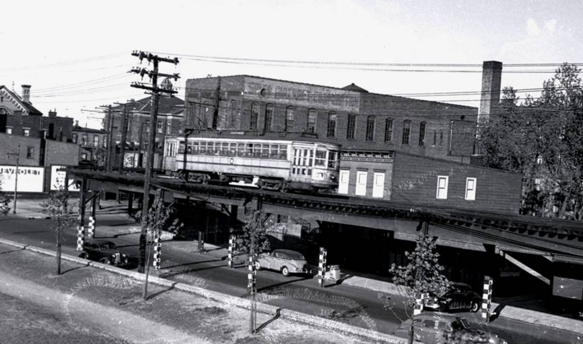
PSNJ 2749 OBSERVER HWY NEAR HOPE ST. Actually Jersey City - Corner of Central and Booram facing north – where the el structure turns east towards Hoboken. Warehouse building with faded sign still exists at SE corner Central & Booram. Building w/ cupola roof is on north side of Ferry St just East of Central.