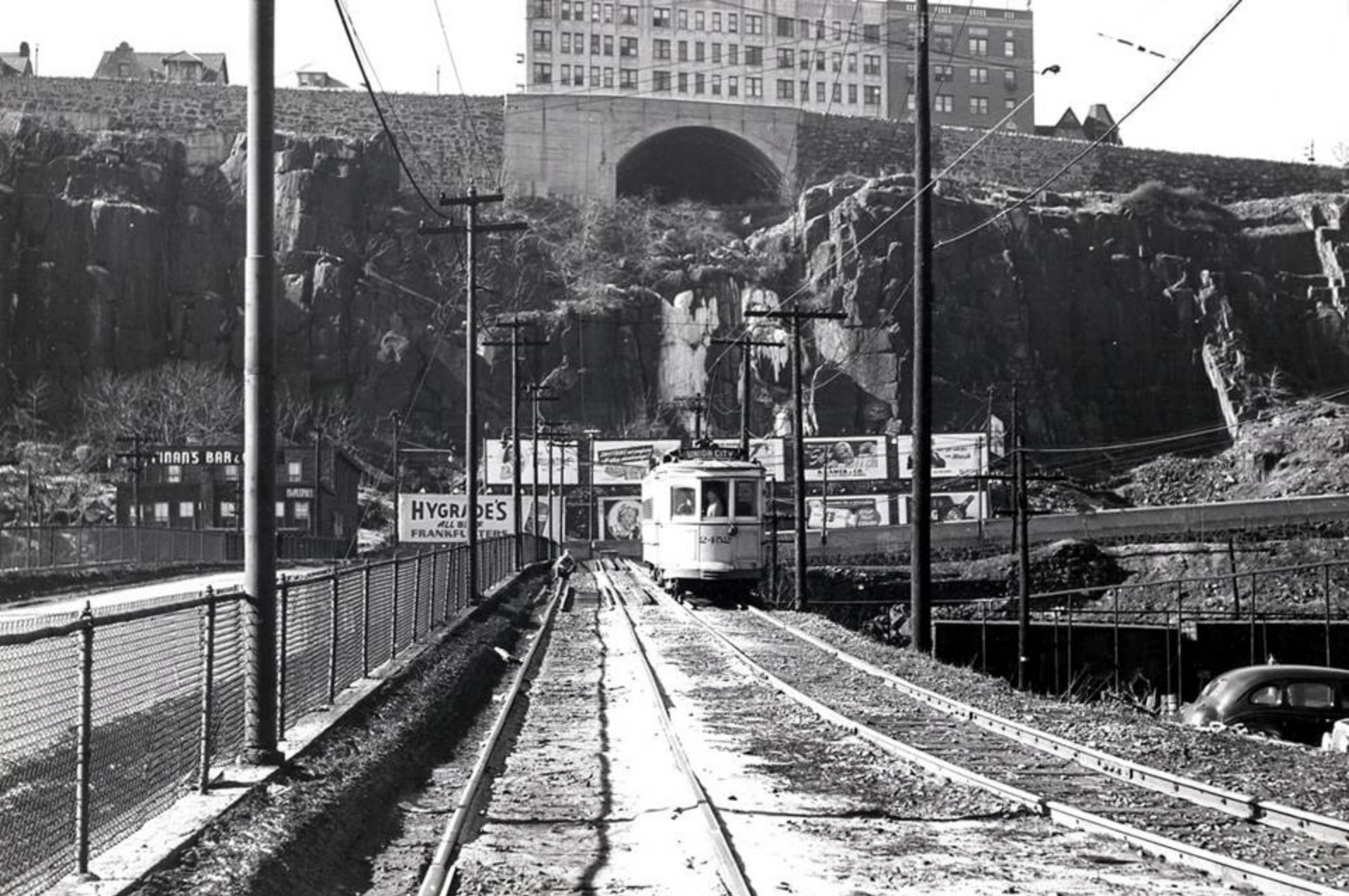
PSNJ 2452 leaving Weehawken Terminal for climb up to Pershing