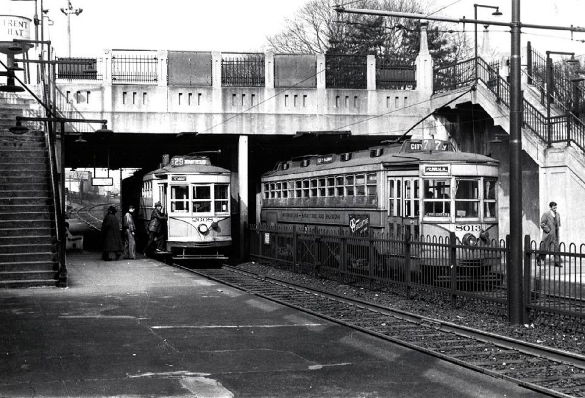
PSNJ 2608 8013 Newark Subway Line