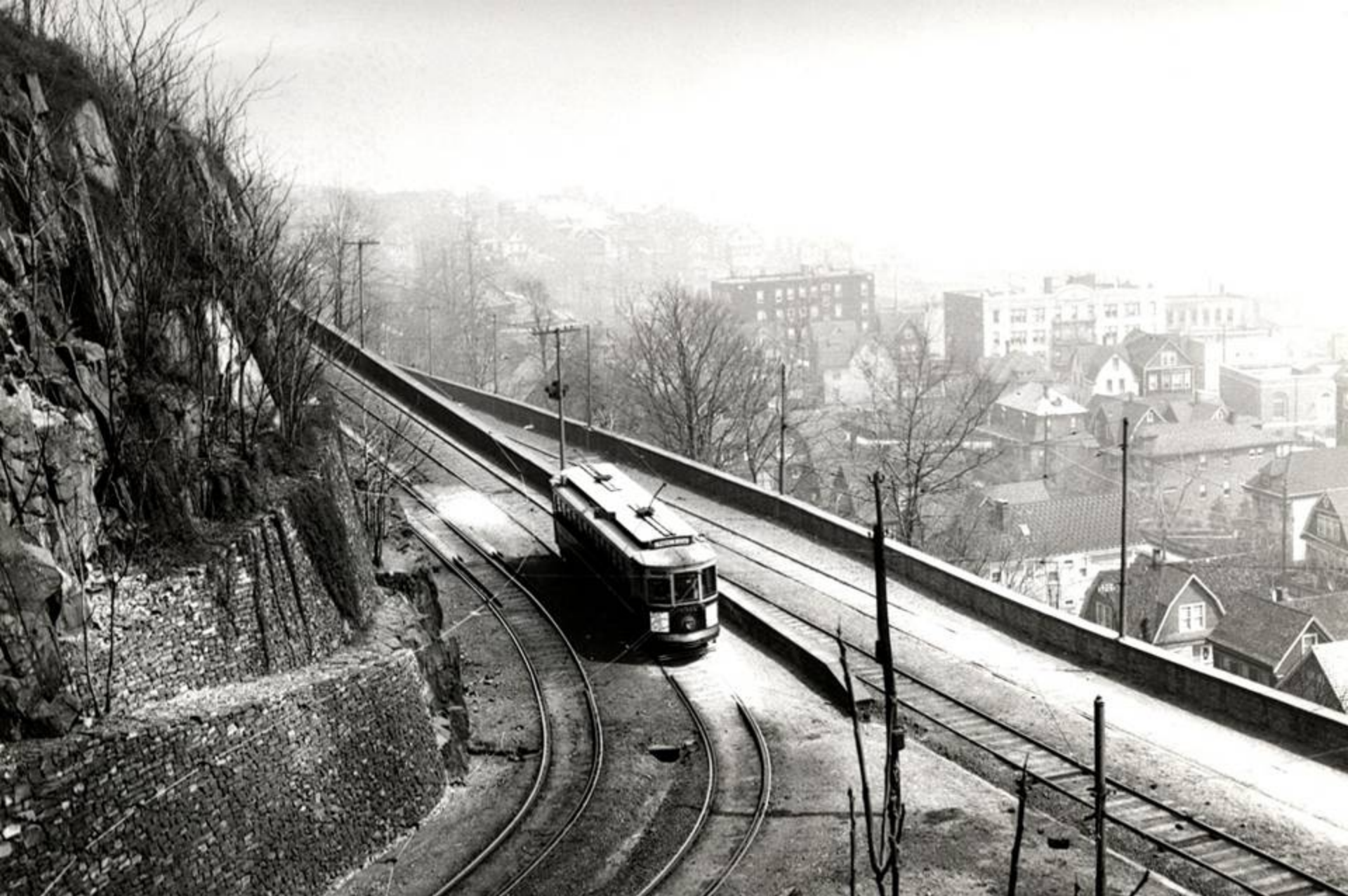
PSNJ 3512 Horseshoe Curve Palisades, NJ