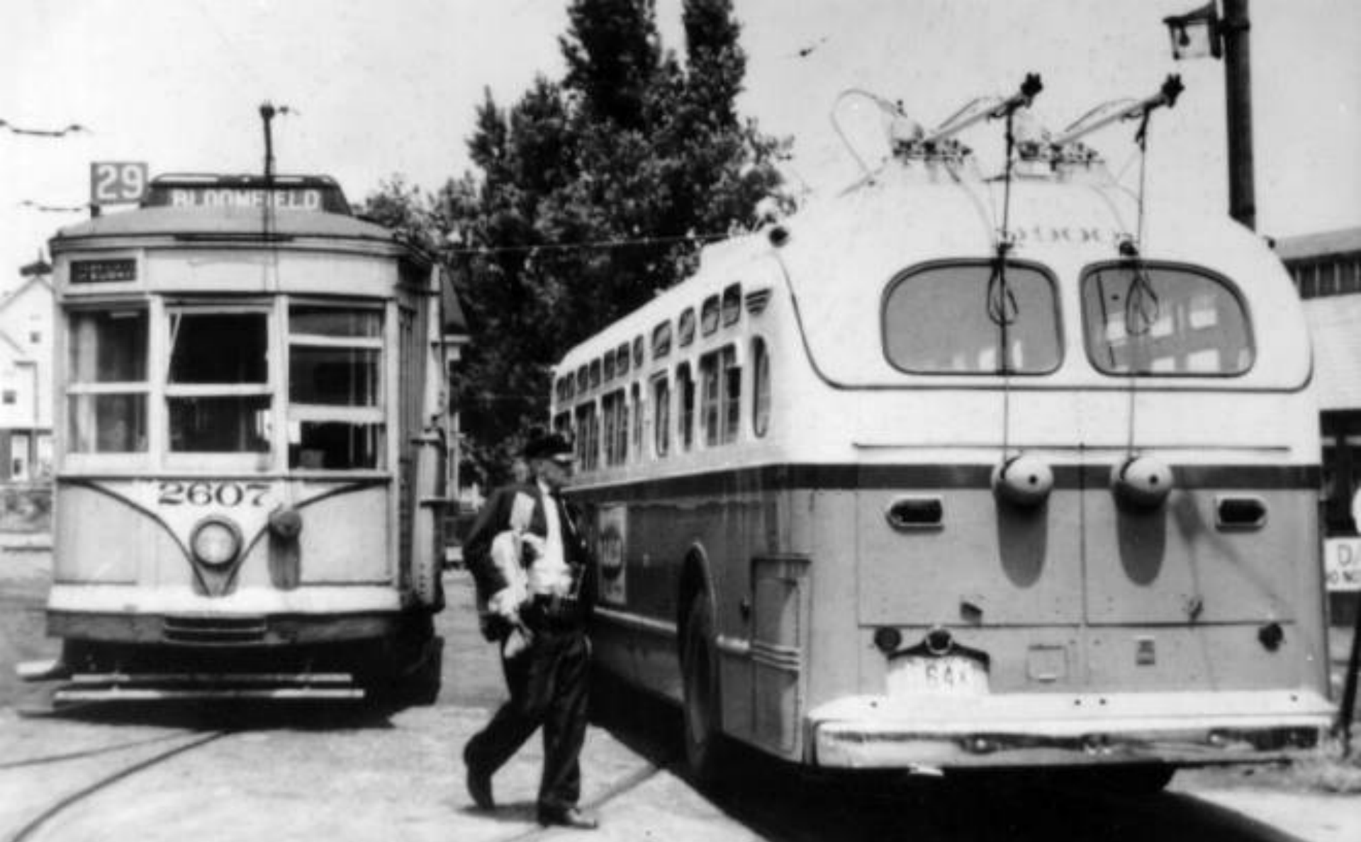
PSCT 2607 & D900 Roseville Carhouse 1950