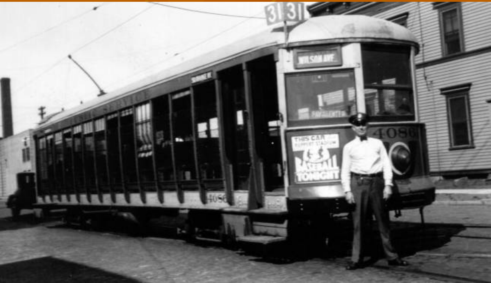
PSNJ 4086 Center Aisle open car. Wilson Ave. Line