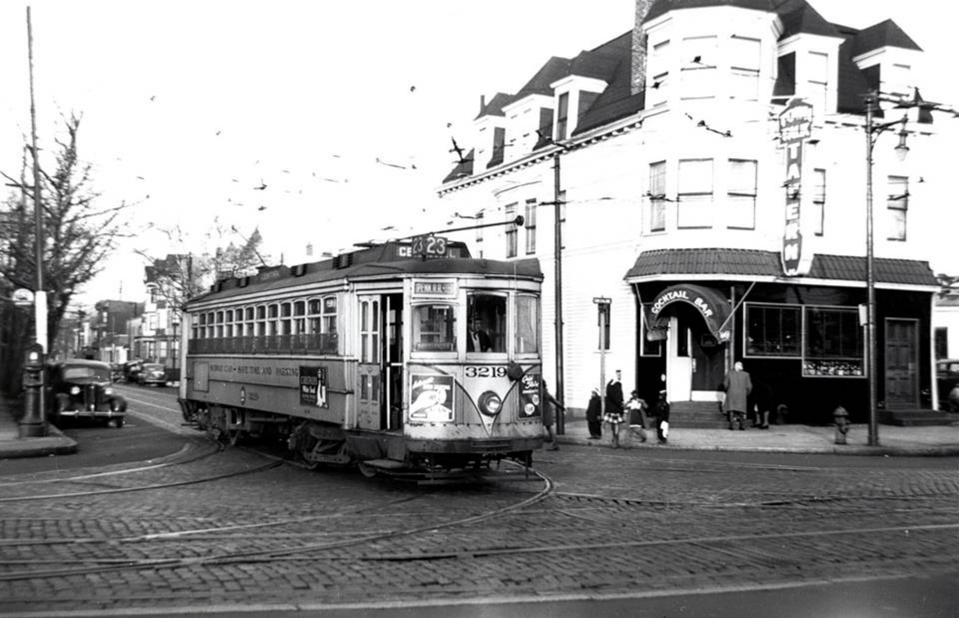
PSNJ 3219 South 14 th St Central Ave. Newark, NJ December 11, 1947 – Definitely Central Ave (can see street sign), but if this is 14th St - none of those buildings exist now.