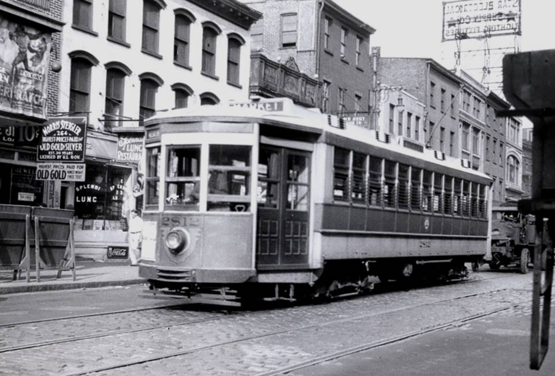
PSNJ 2812 Market Street east of Mulberry St. in Newark, NJ June 18, 1934