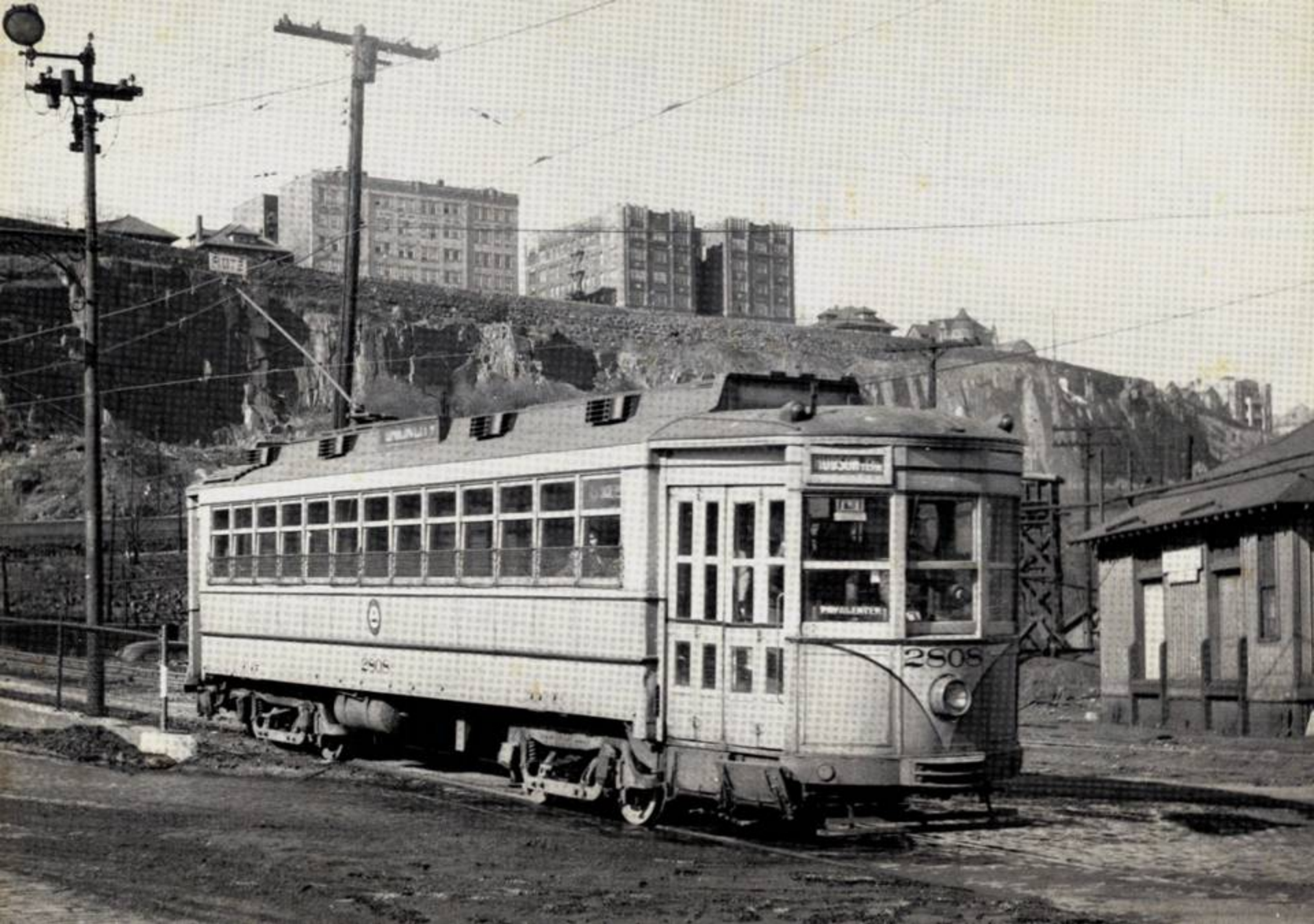
PSNJ 2808 Weehawken Terminal Union City Line