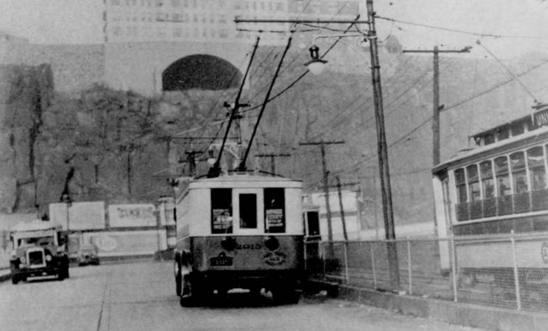
PSNJ 22015 leaving Weehawken Terminal for climb up to Pershing