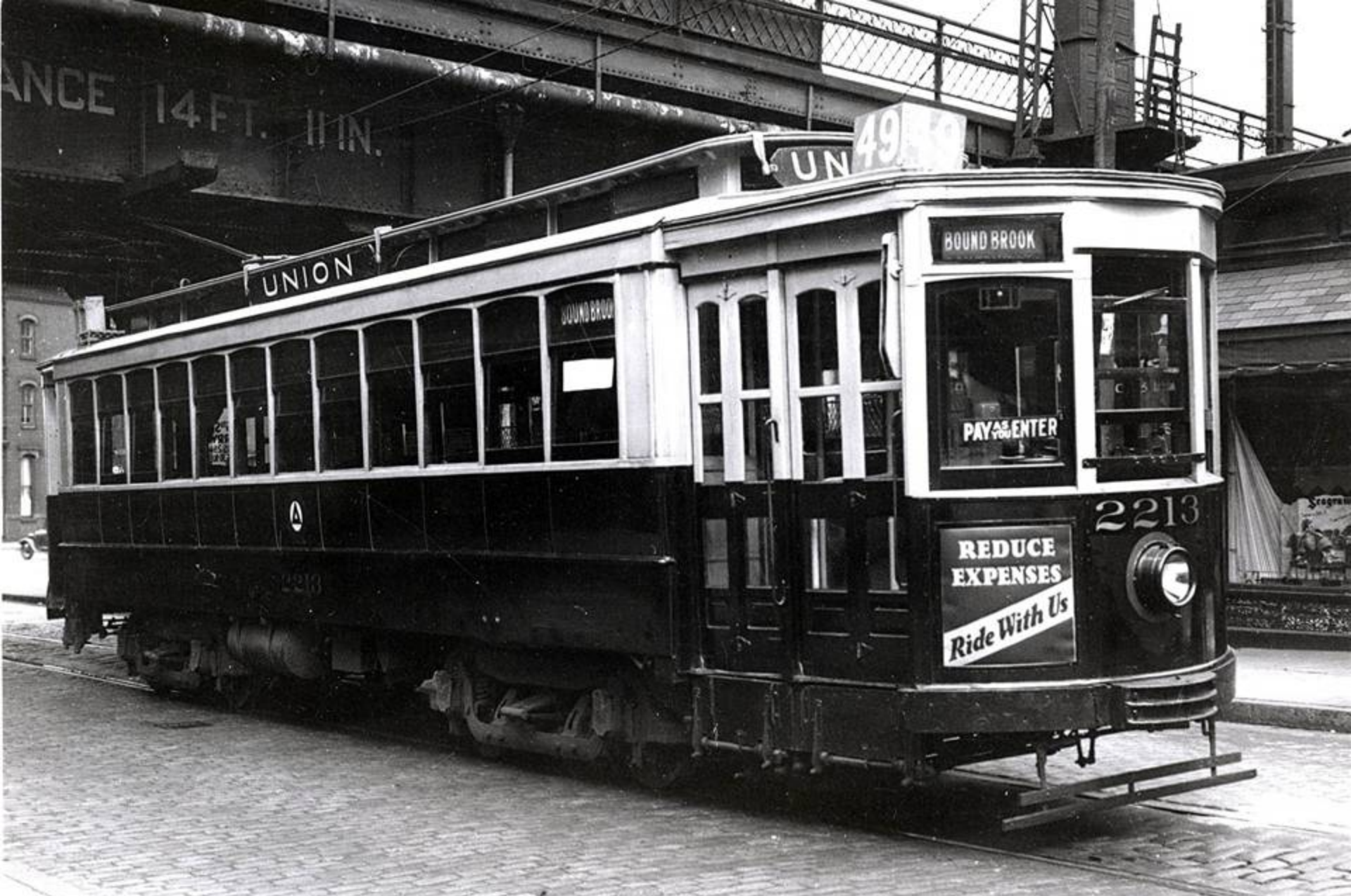
PSNJ 2213 DL&W Station Newark, NJ August 25, 1935