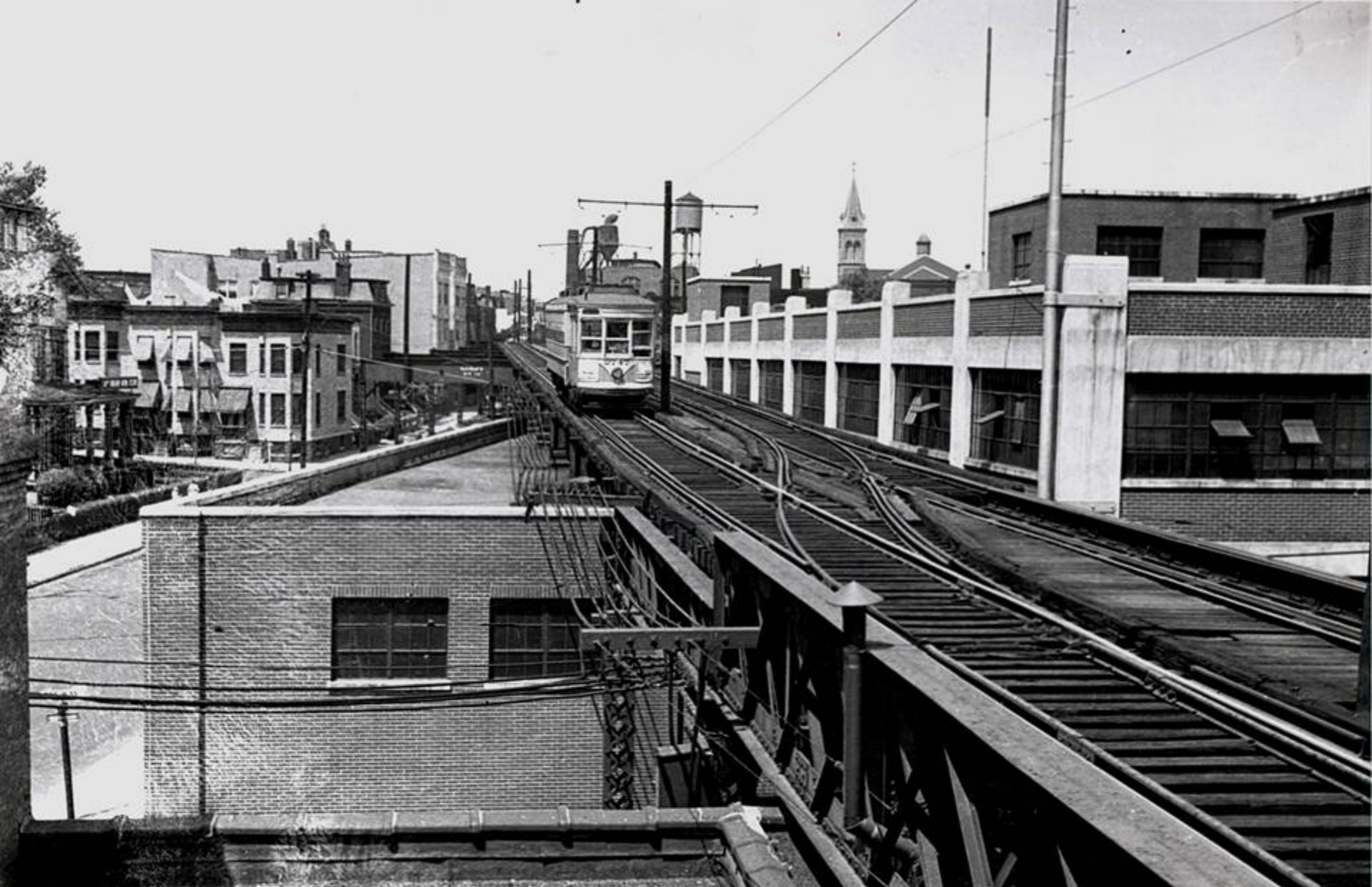
PSNJ 2747 NEW YORK AVE HOBOKEN ELEVATED. It's Jersey City, at the intersection of New York Avenue and Ravine Avenue looking west. The warehouse at right still exists, so do the garden house and brownstones with awnings at left (that is the corner of Ravine & Webster). The church steeple at right is at corner of Ferry & Central.