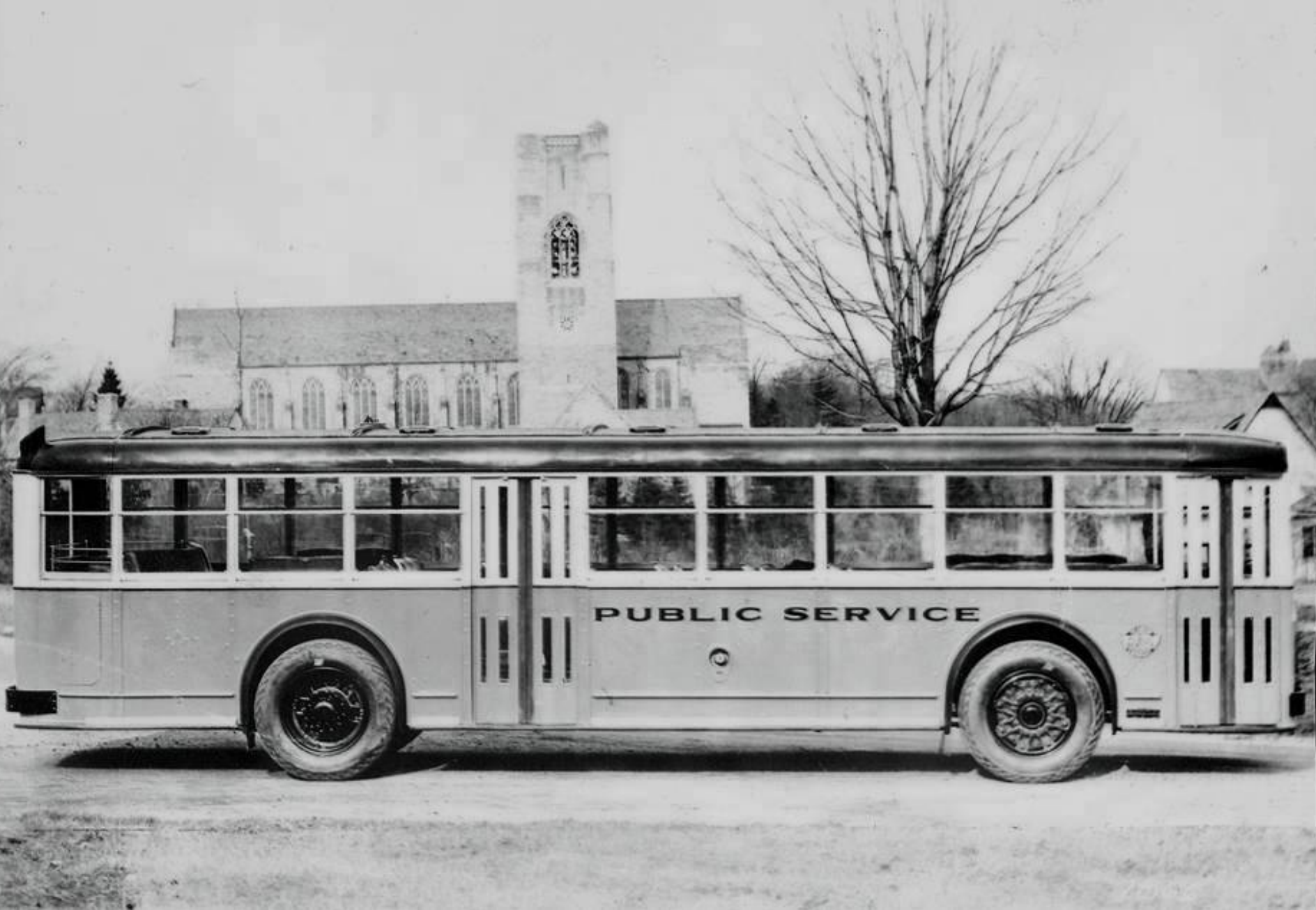
PSNJ 1927 Model Bus Possibly from Cincinnati Car Co.?