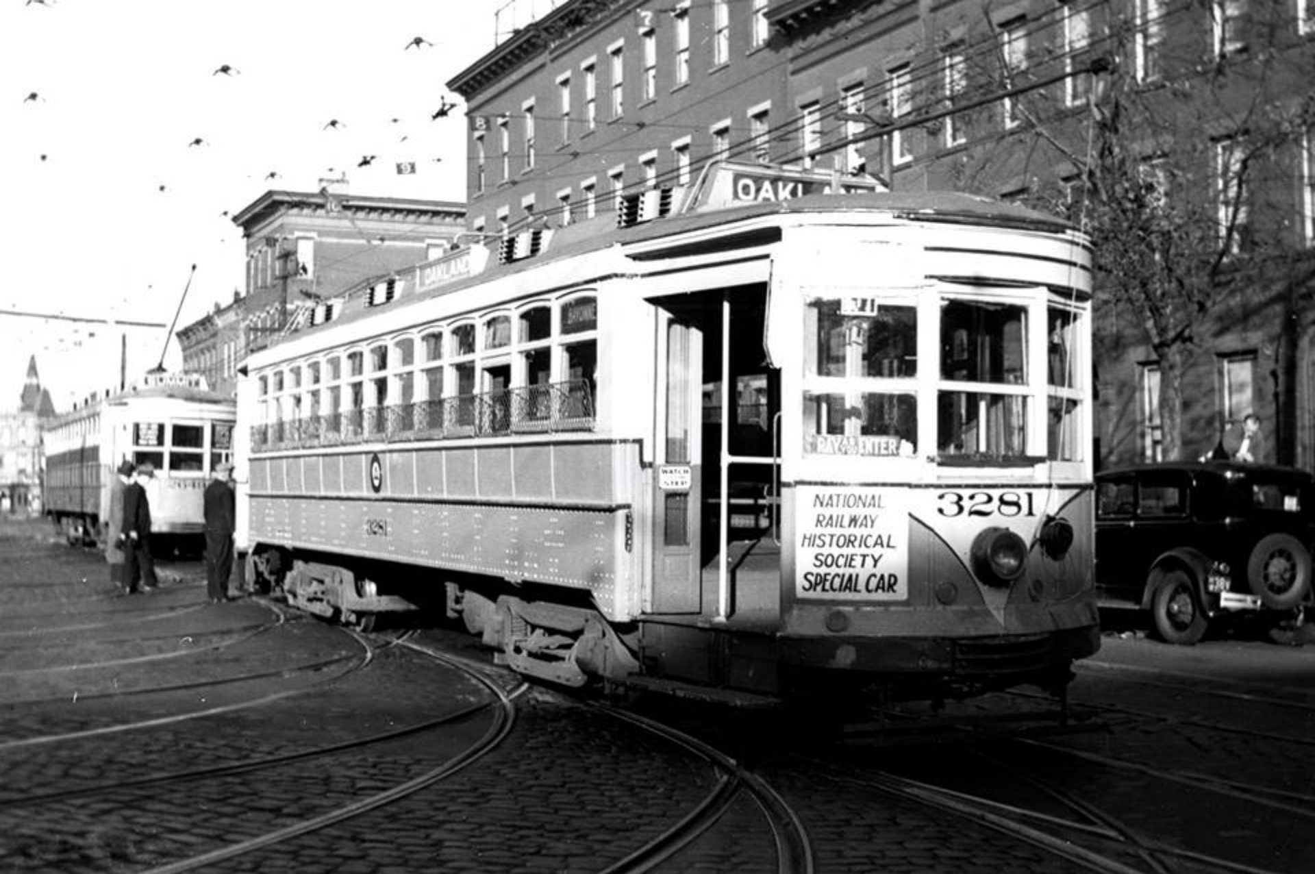
PSNJ 3281 Union City Car House October 26, 1941