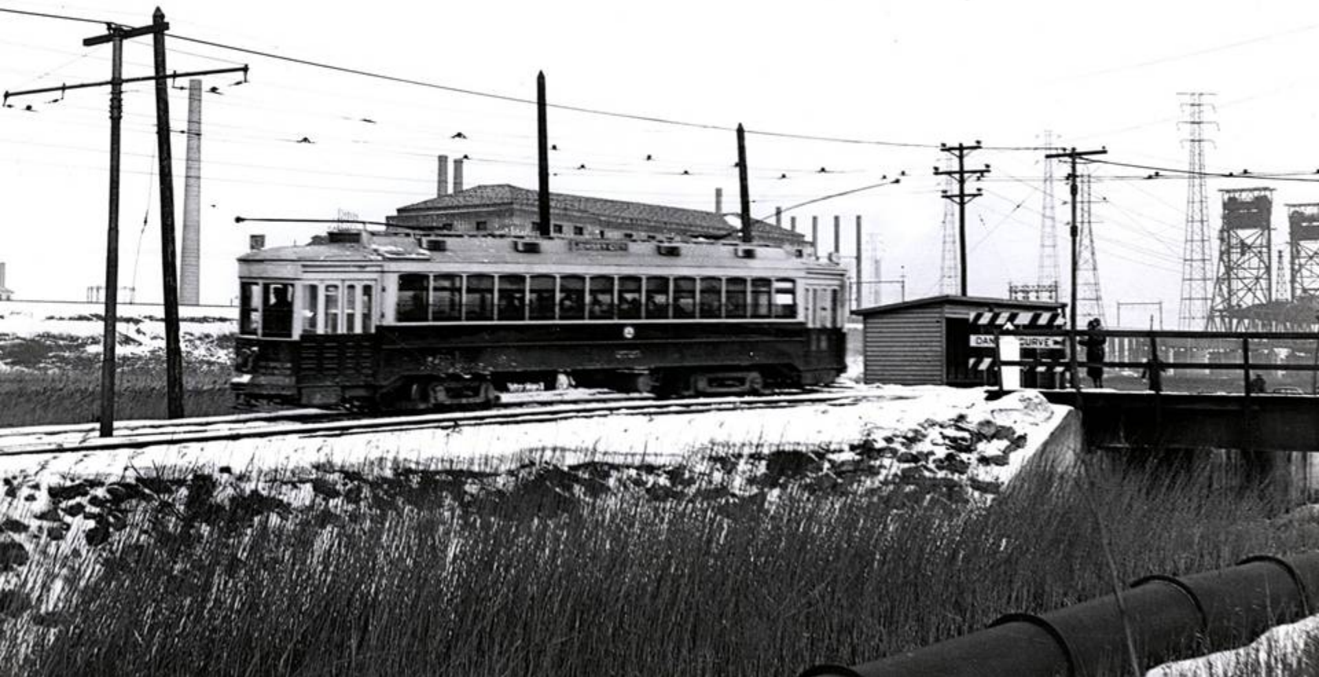
PSNJ 2725 Kearney, NJ February 10, 1936 - Near present Meadows Maintenance Center for NJT