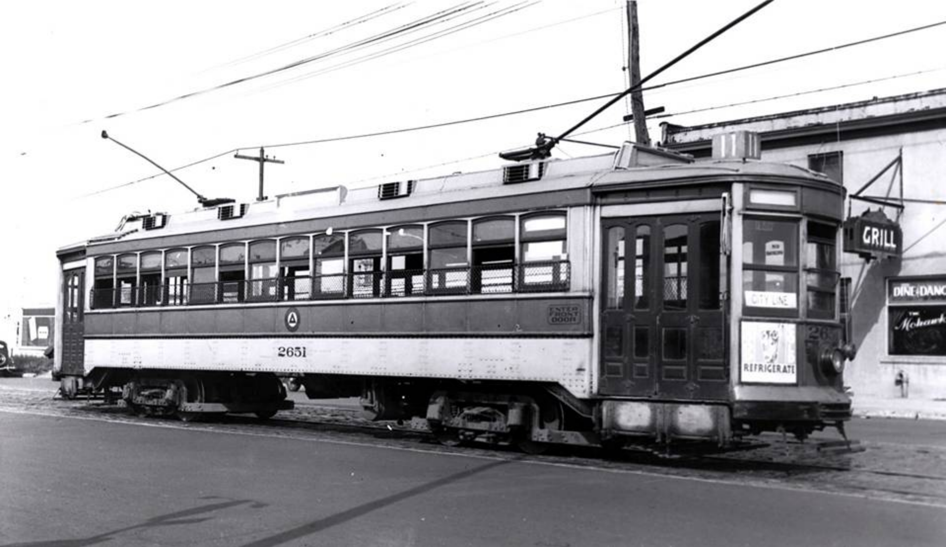
PSNJ 2651 Crossover at Newark, NJ City Limits July 2, 1936 This car is currently undergoing restoration at Ringos, New Jersey