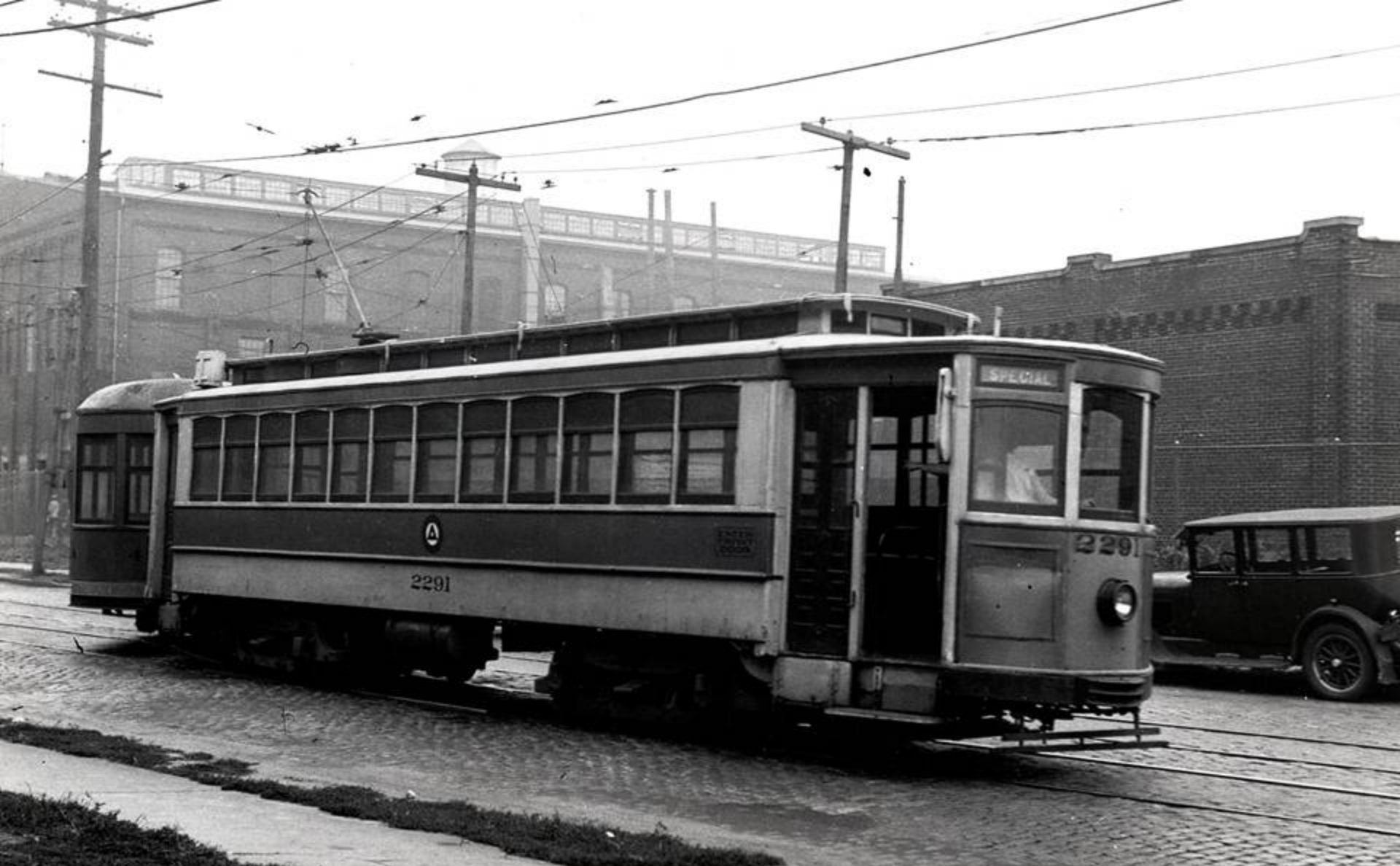
PSNJ 2291 Plank Road Shops Newark, NJ August 28, 1936