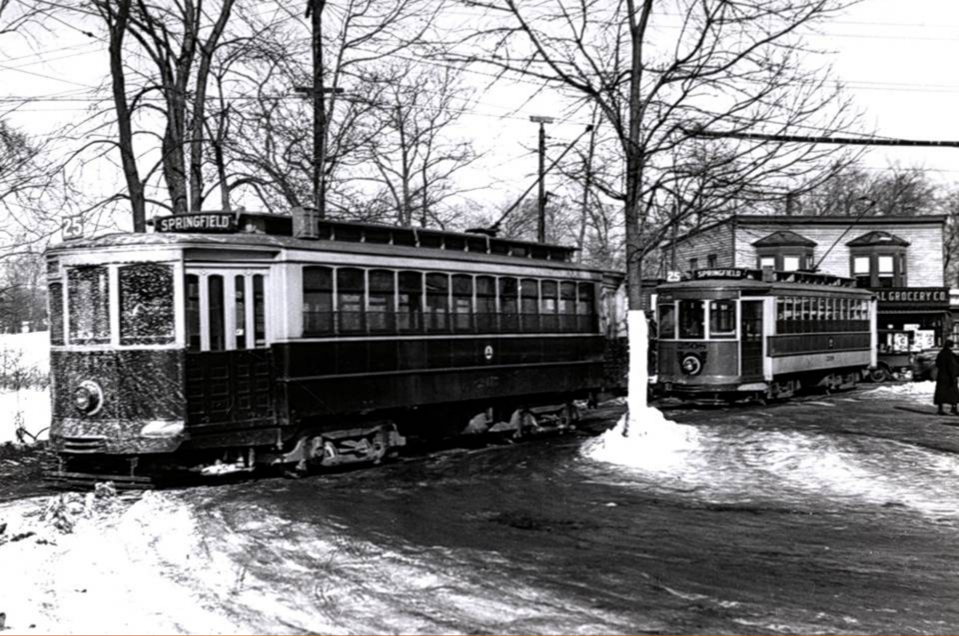
PSNJ 2414-2508 Camden Div. Maplewood, NJ January 24, 1936