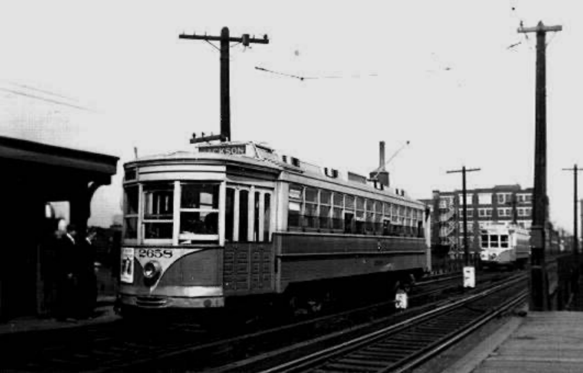
PSNJ 2658 on Hoboken Elevated