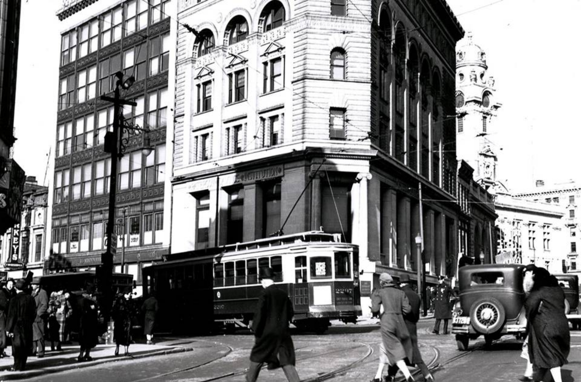
PSNJ 2297 Main and Market Streets, Paterson, NJ March 19, 1937 Facing east on Market St. Building still exists NE corner Main & Market.