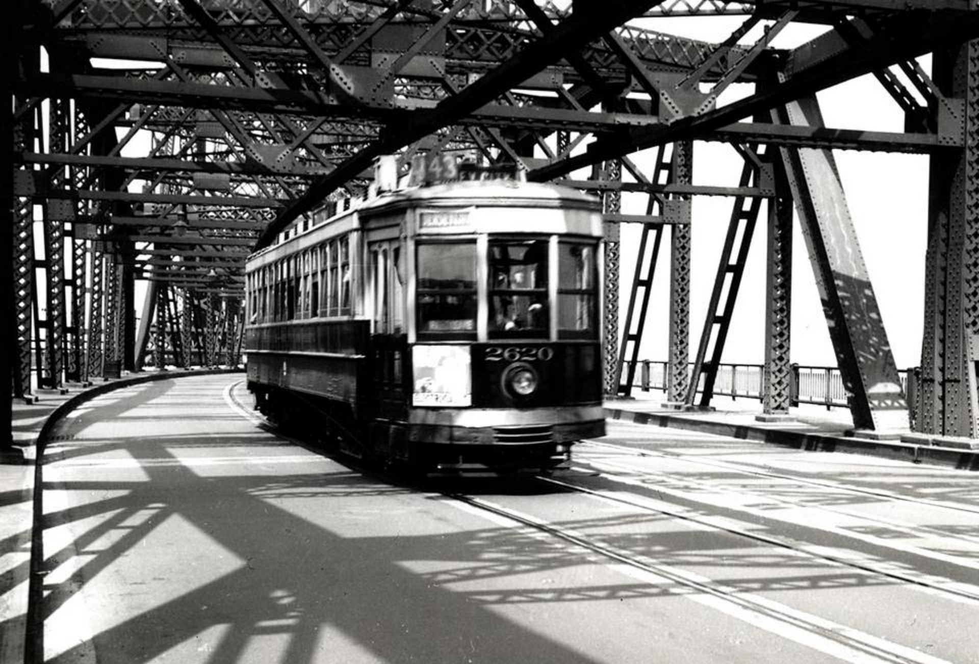
PSNJ 2620 Crossing Hackensack River Bridge in Jersey City, NJ Great view of NJ Rt.7 drawbridge.