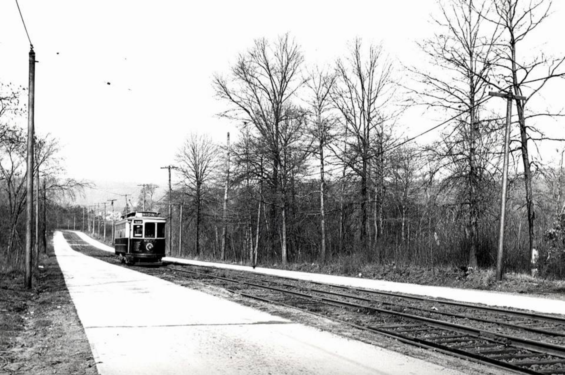
PSNJ 2227 Union Line Plainfield Ave. Scotch Plains, NJ April 24, 1934