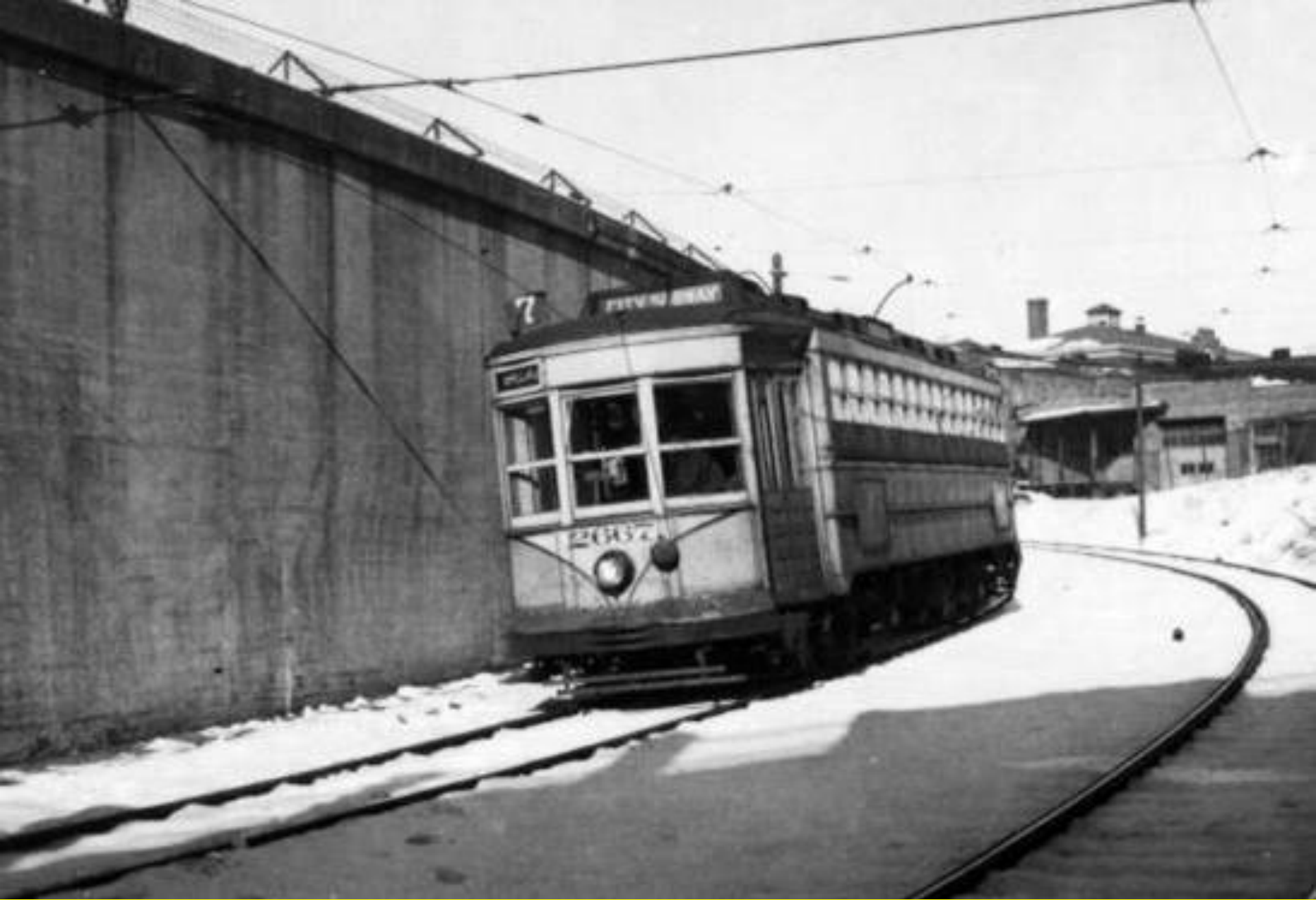
PSNJ 2667 Newark Subway Line WDV Neg. Collection