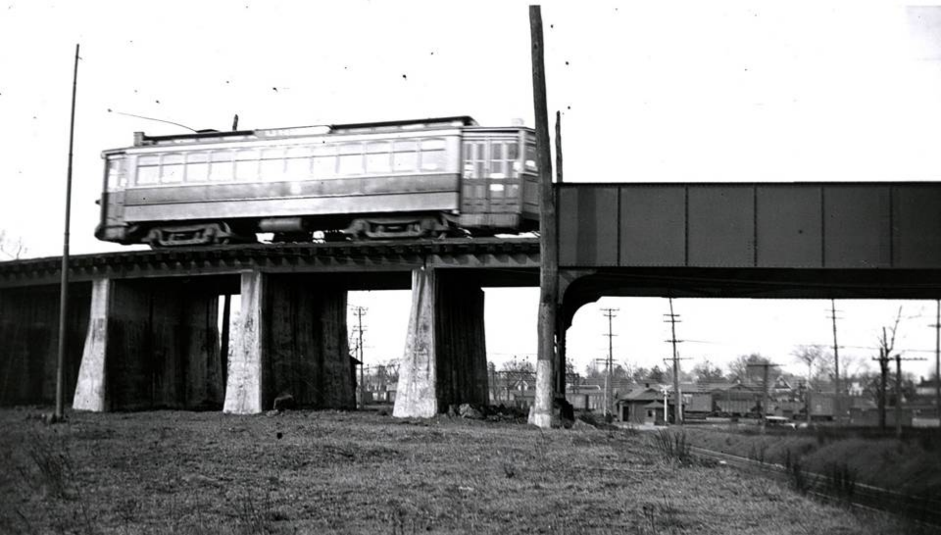
PSNJ_2272_B&O TRESTLE RT-4 UNION. ALDENE,N.J. January 18, 1933 - South Ave & Lincoln. Probably the trolley line had to bridge the RR rather than cross at grade. PSNJ book shows a bump out in the track map at this location.