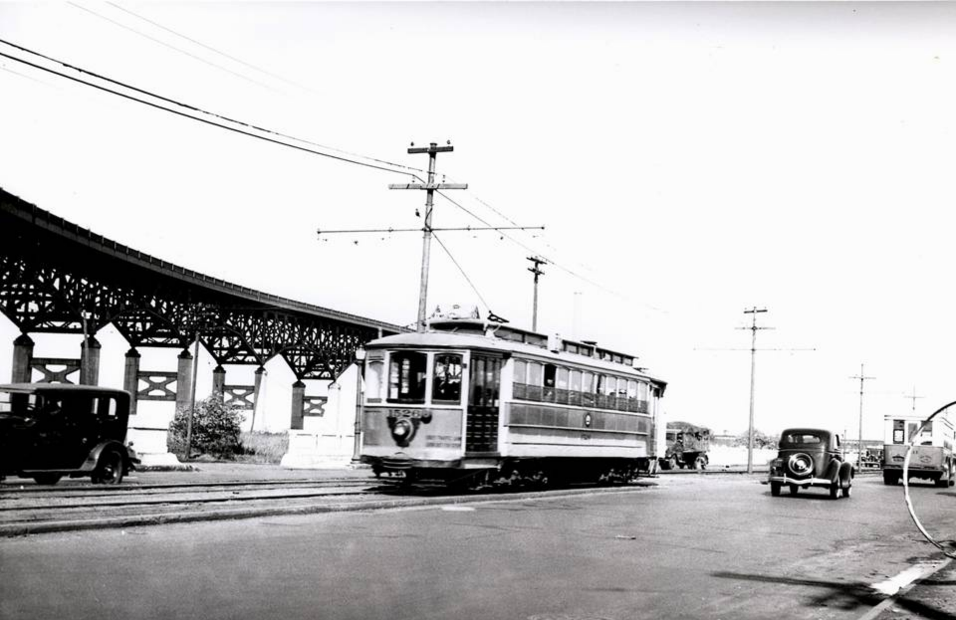
PSNJ 1526 Lincoln Highway (U.S. Rt. 30) Jersey City, NJ May 14, 1936 - Raymond Blvd at present day NJ Turnpike exit ramp facing east.