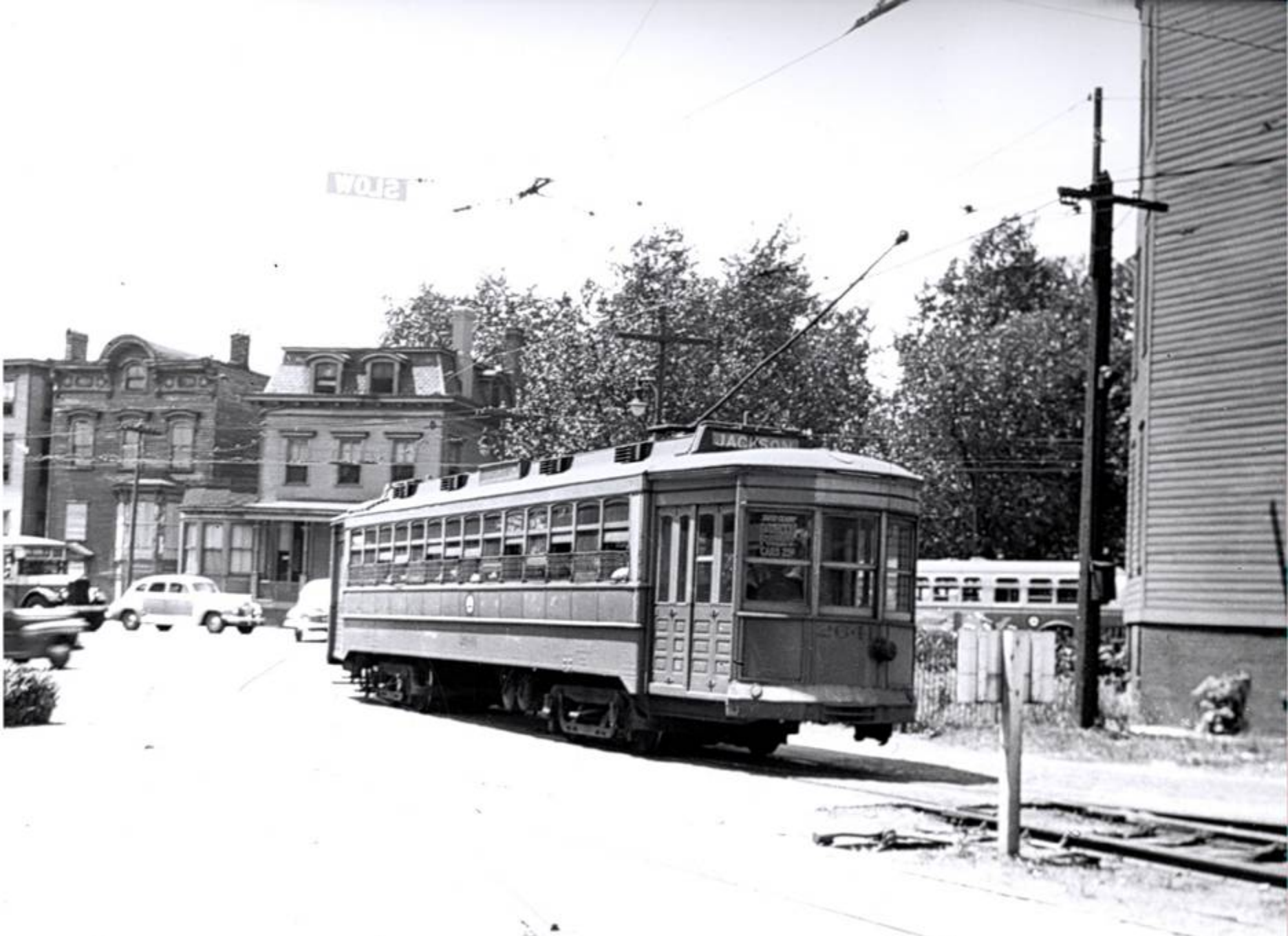
PSNJ 2641 Jackson Line