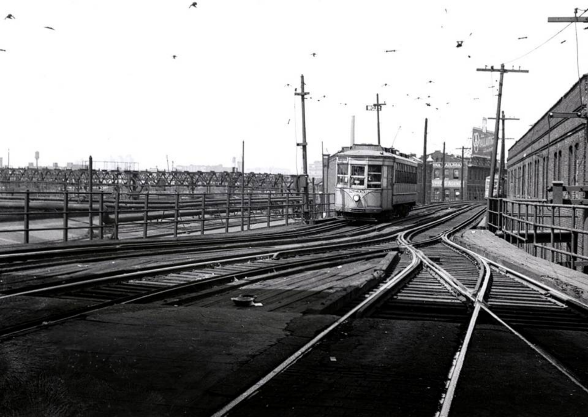
PSNJ 2805 Approaching Weehawken Terminal