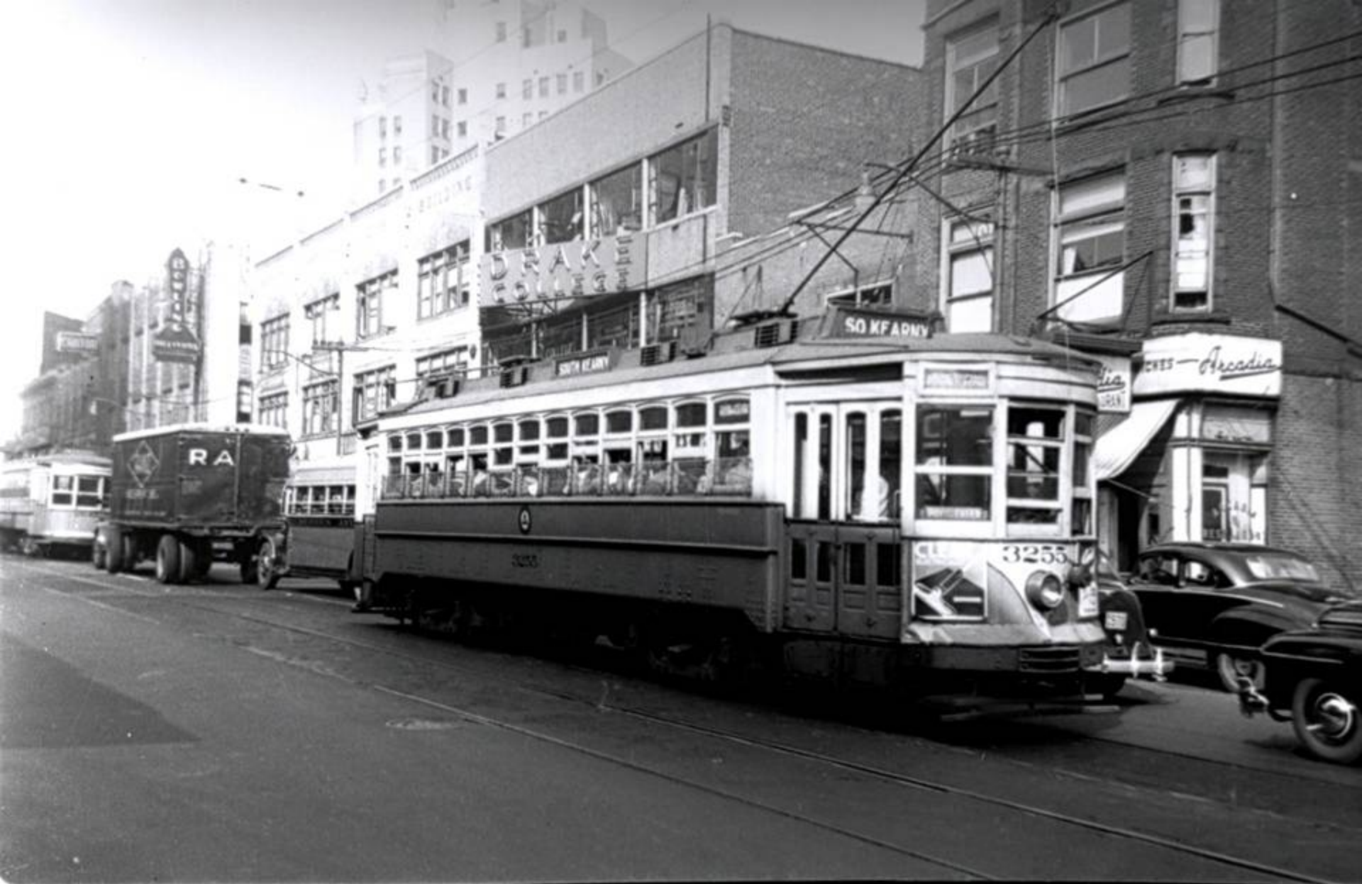
PSNJ 3255 Bergen Ave. Line Academy - South Kearney Line Actually Bergen Ave & Newkirk -Jersey City facing north (east side of street)