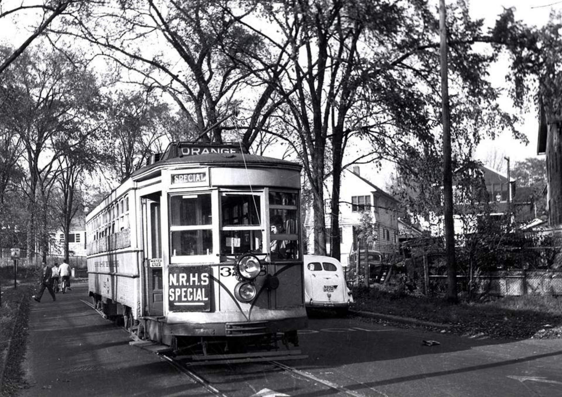
PSNJ 3258 on fantrip at unknown location.