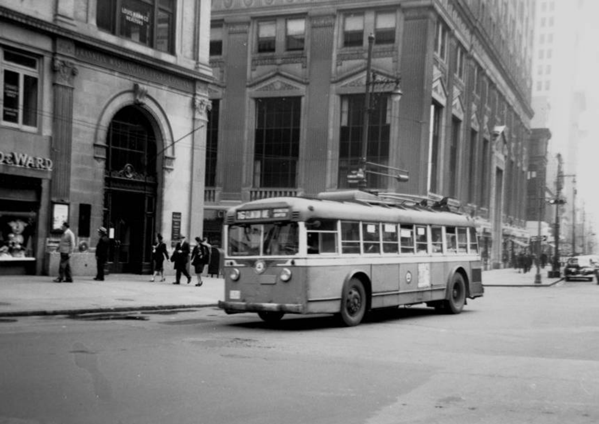
Operating as gas bus on Broad Street in Newark, NJ