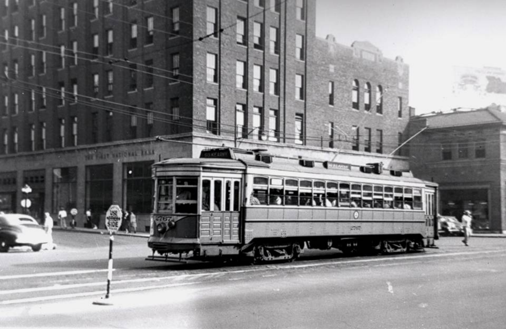
PSNJ 2767 Bergen Ave. Line Academy - South Kearney Line Actually Bergen Ave & Newkirk -Jersey City facing north (east side of street)