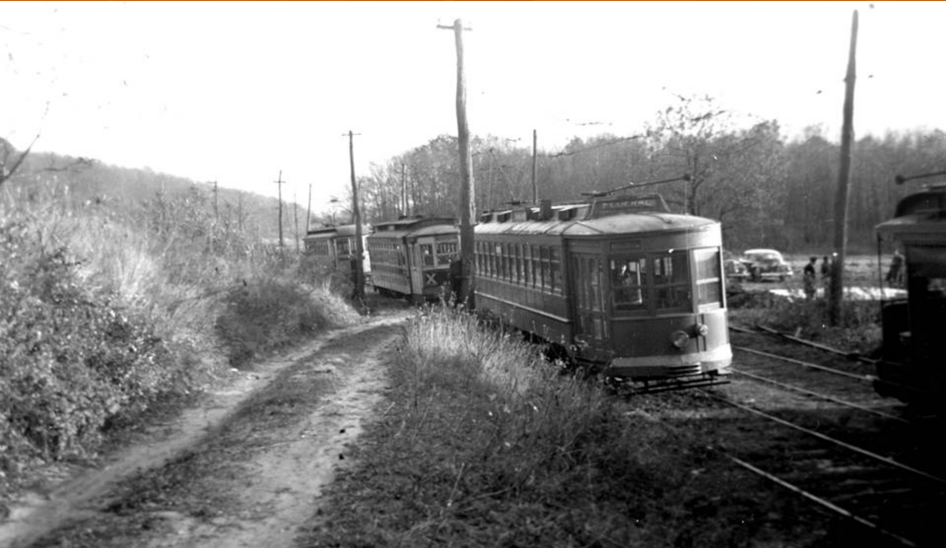
PSNJ 2431 at Branford Museum ca. 1947