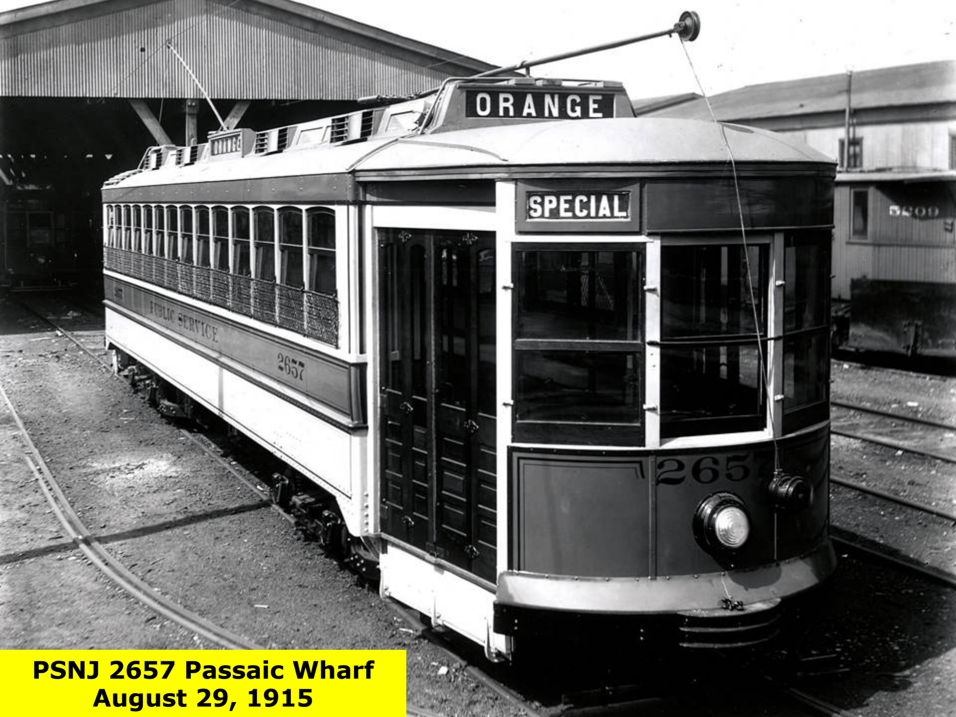
PSNJ 2657 Passaic Wharf August 29, 1915