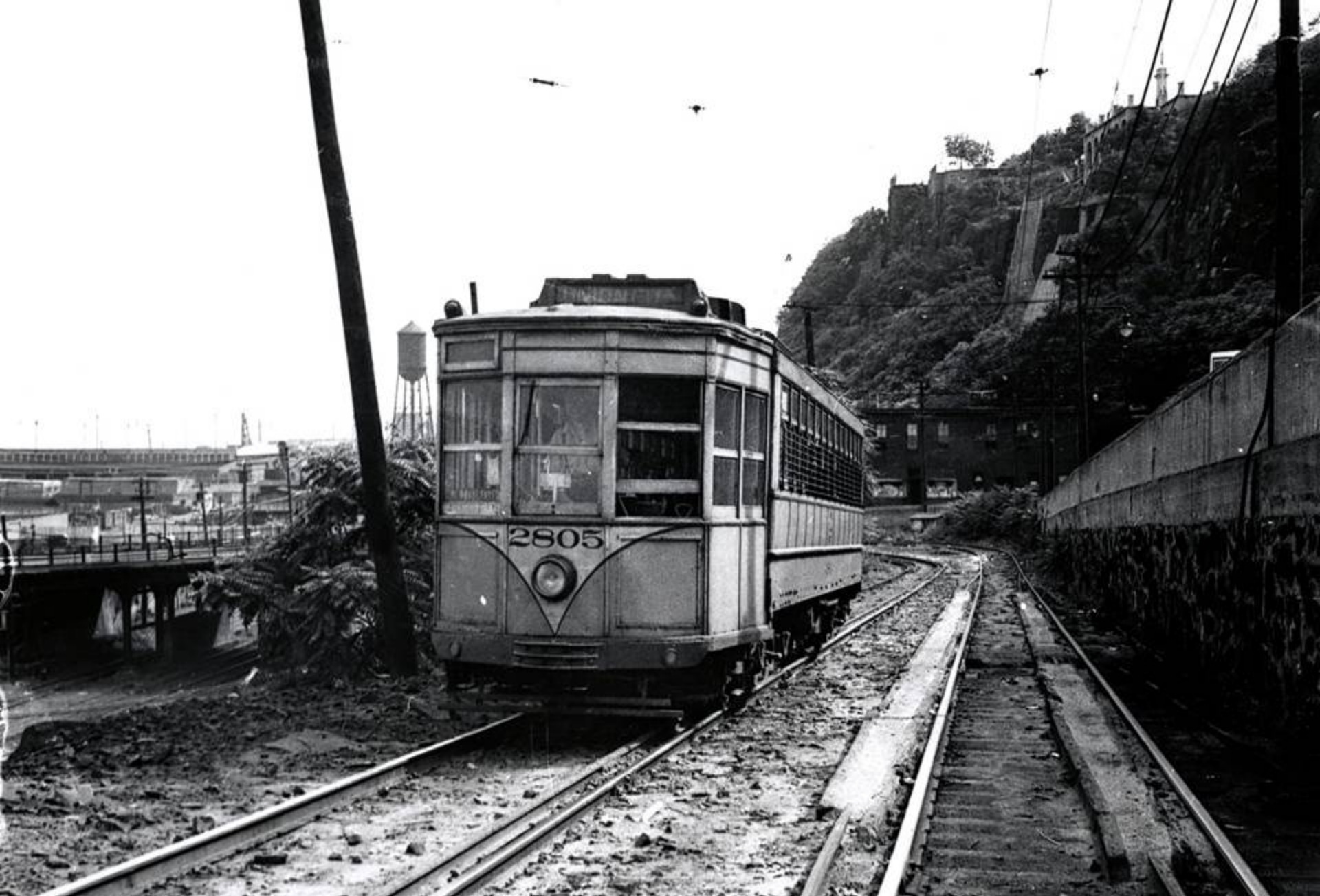
PSNJ 2805 climbing hill from Weehawken to Pershing Road Union City Line