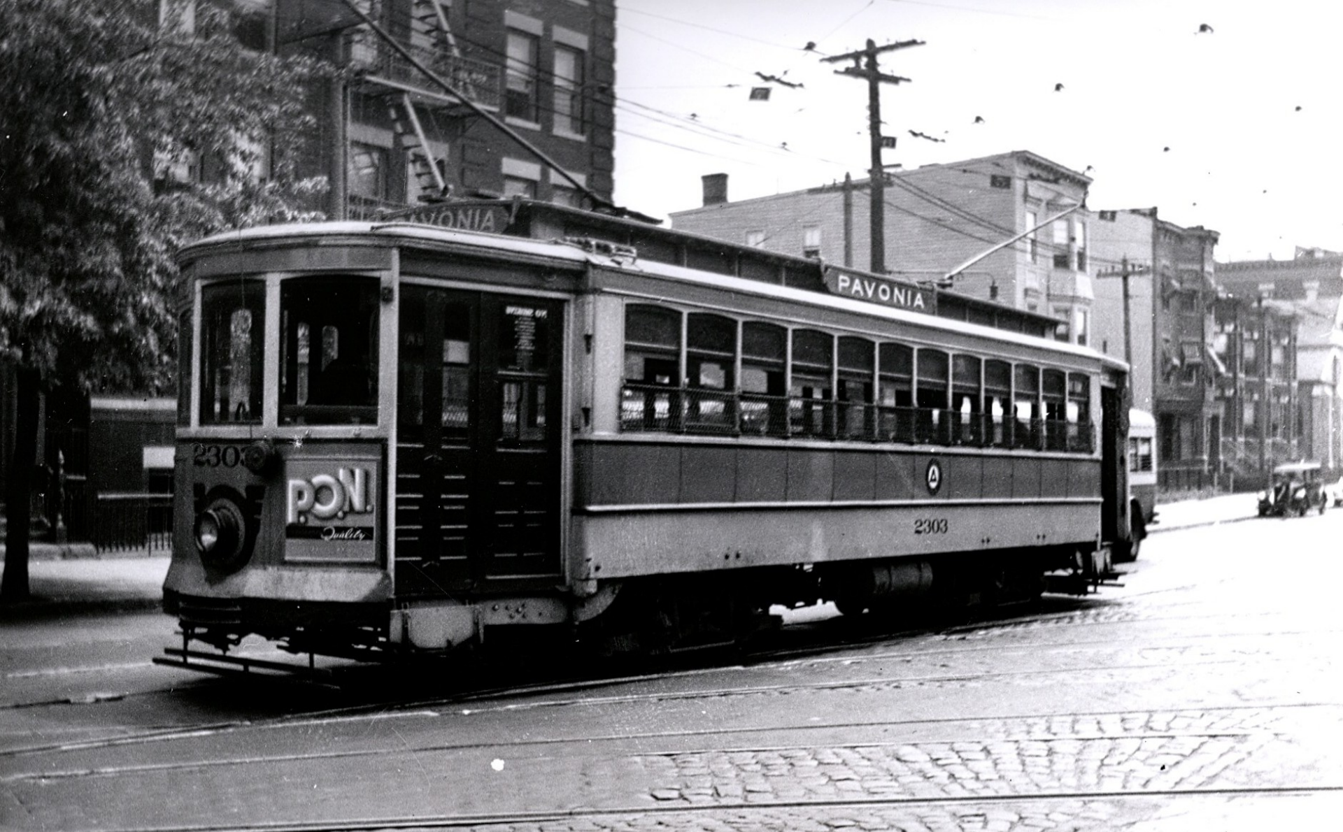
PSNJ 2303 - Union City, NJ July 13, 1937 - New York Avenue between 28th and 27th (Angelique St) outside car barn (now Union City Police). View facing South/east side of street. All buildings still exist.