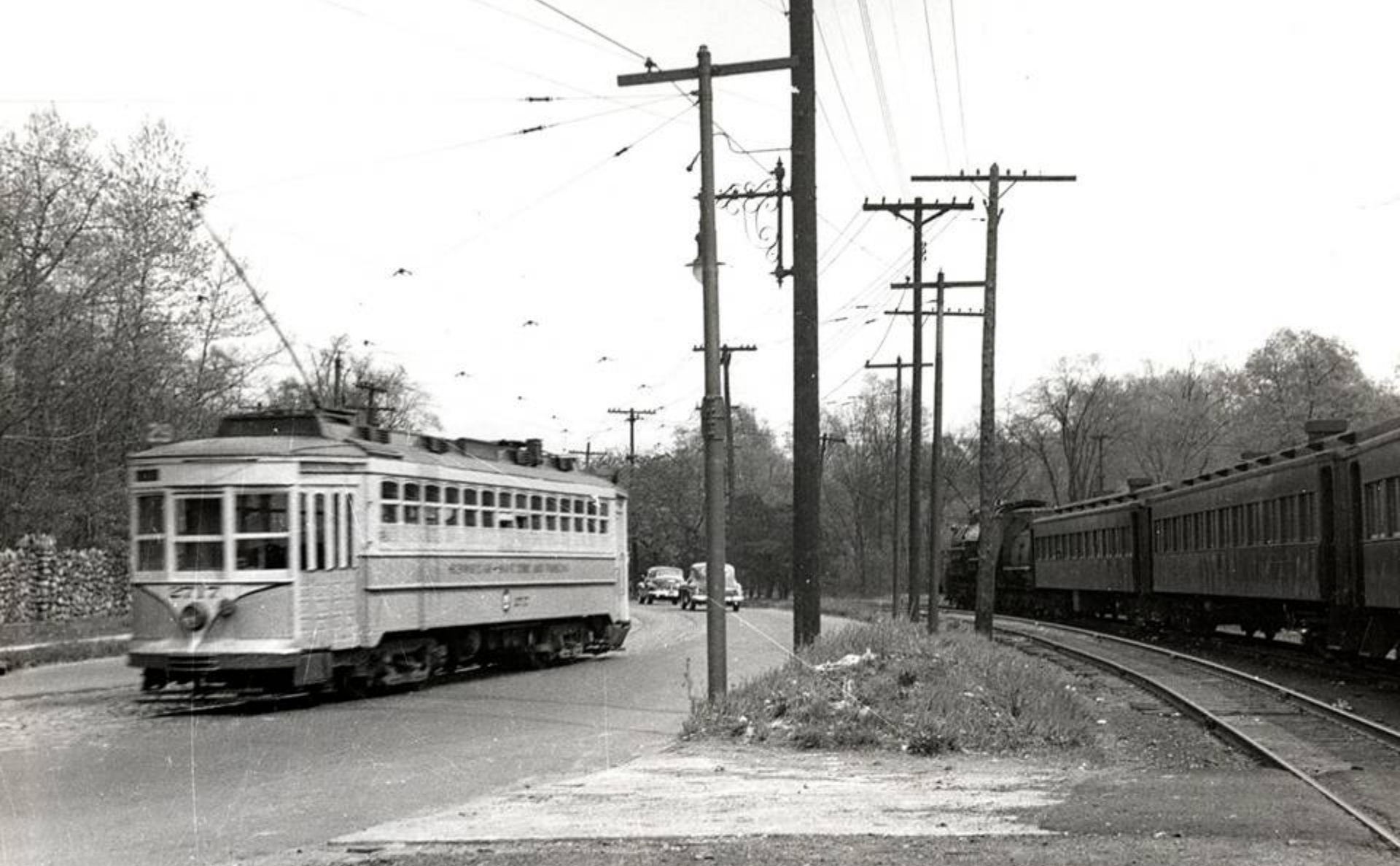
PSNJ 2717 Passing Erie RR on Bloomfield Ave. at Caldwell College (between Elm & Arlington) facing east. Stone wall at left is still there - but no traces of railroad (Erie Caldwell Branch-Morristown & Erie further south)--