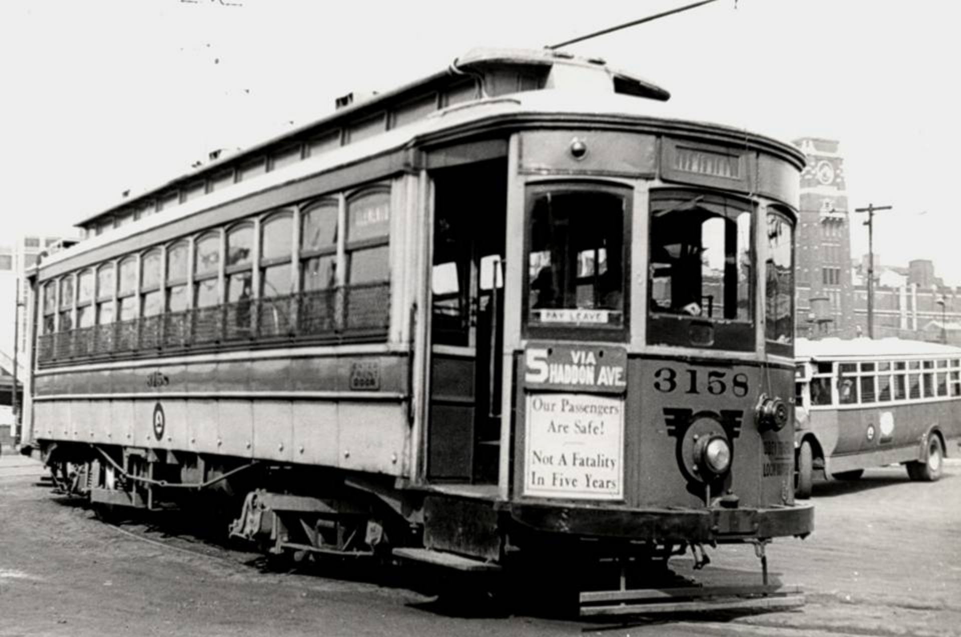
PSNJ 3158 Ferry Terminal Camden, NJ April 6, 1935