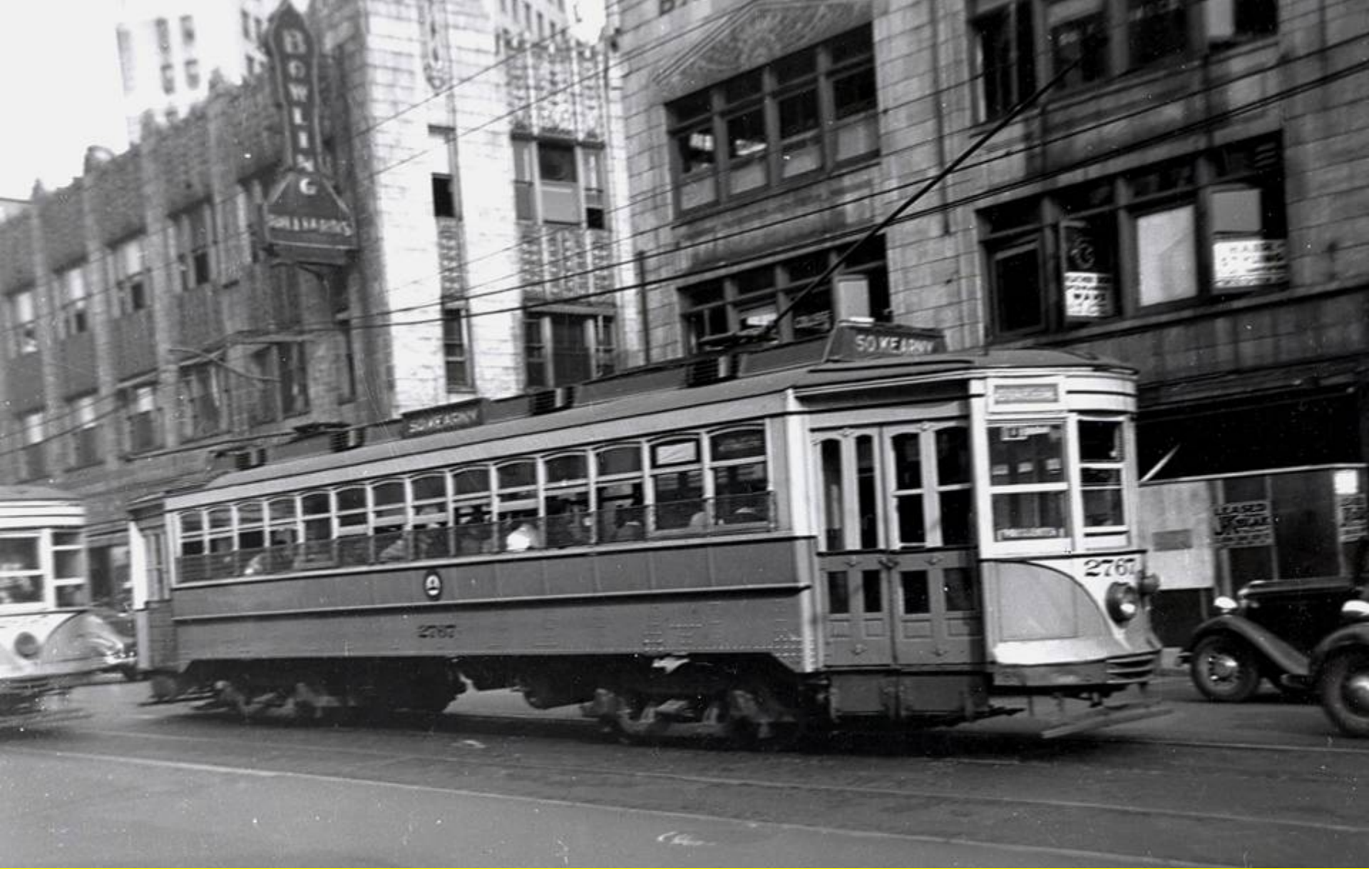
PSNJ 2767 Bergen Ave. Line Academy - South Kearney Line Actually Bergen Ave & Newkirk -Jersey City facing north (east side of street)