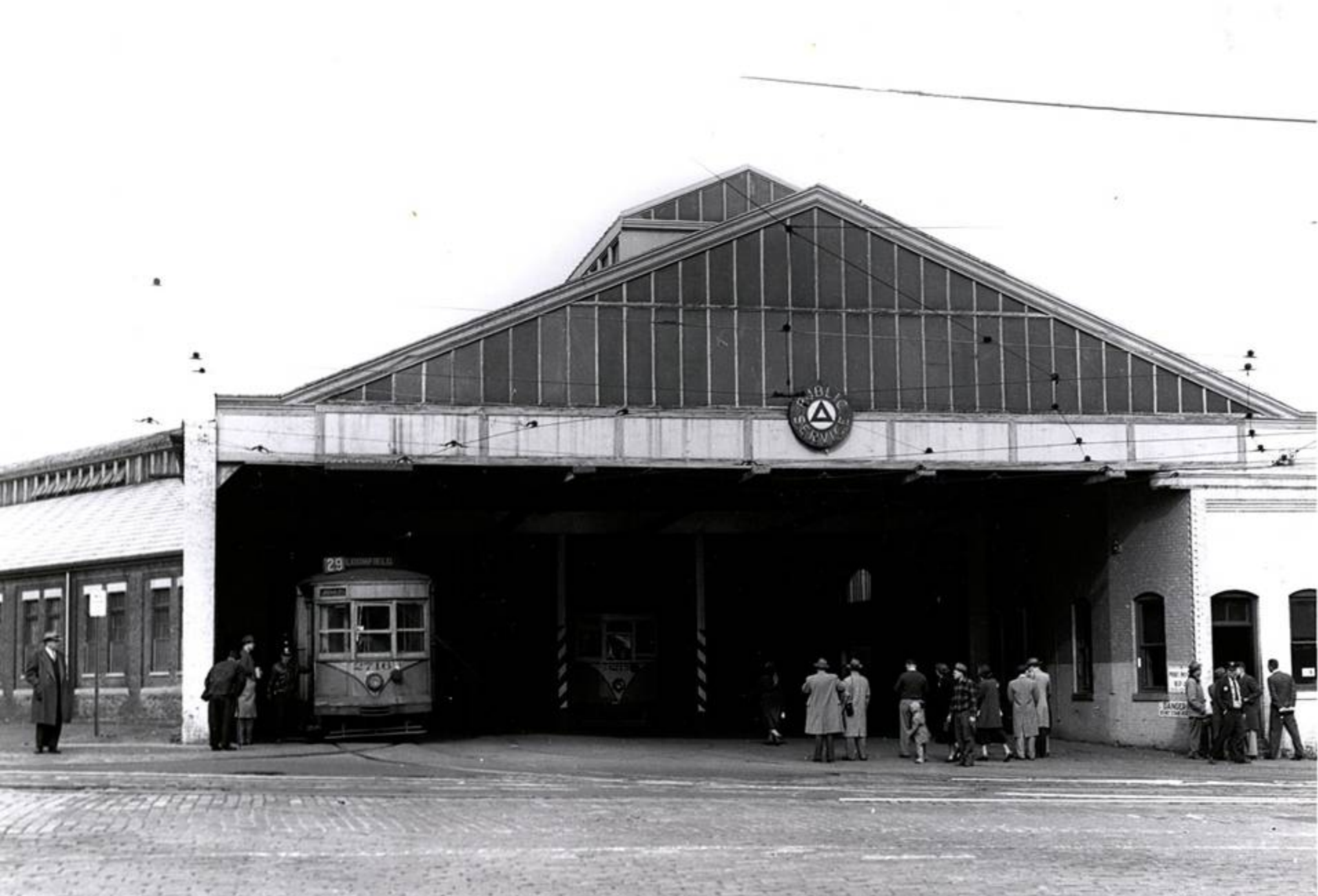
PSNJ 2716 Montclair CH March 22, 1952 Bloomfield Ave & Bell St. facing west -