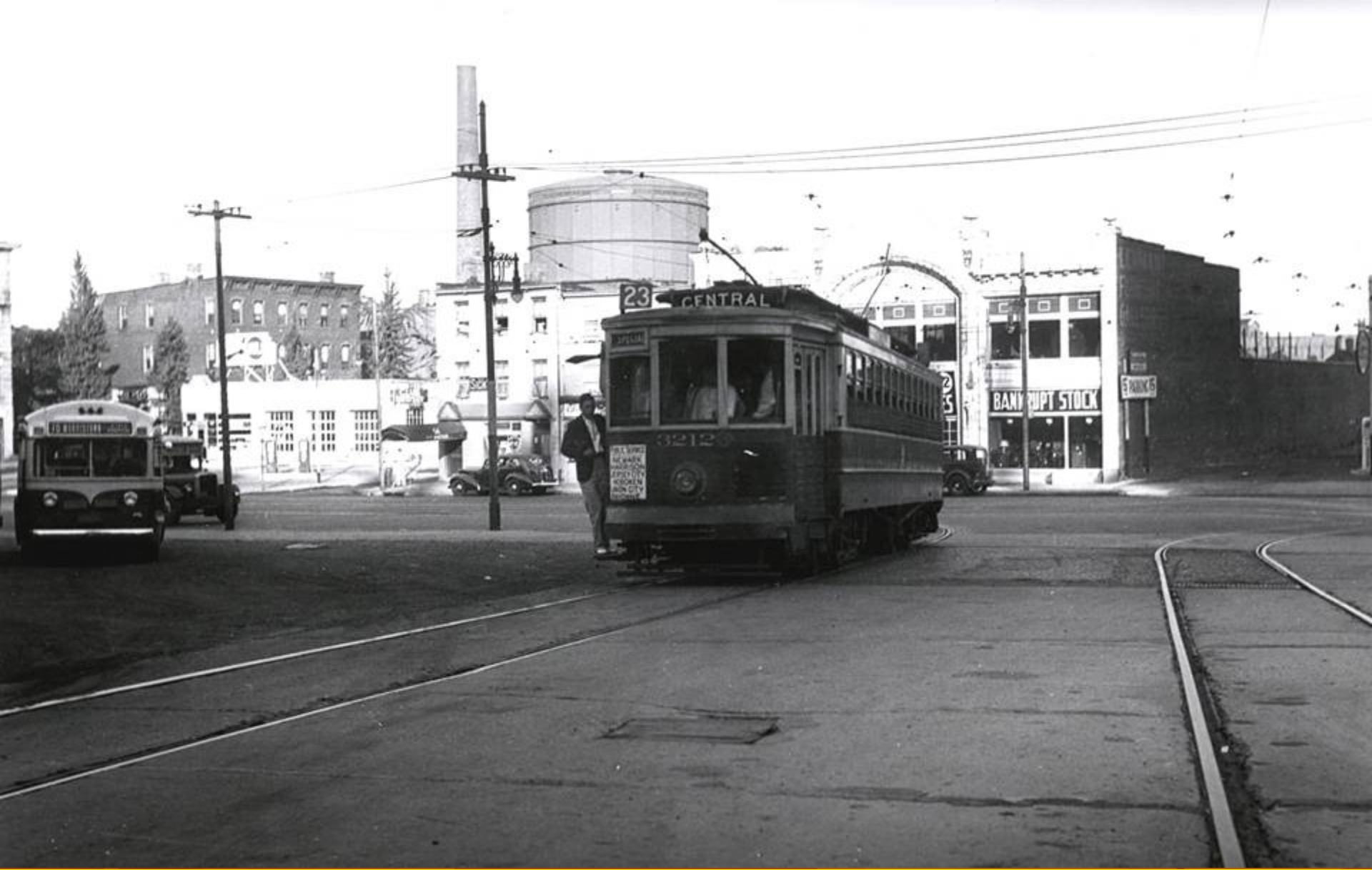
PSNJ 3212 entering upper level of Newark downtown terminal. August 16, 1937