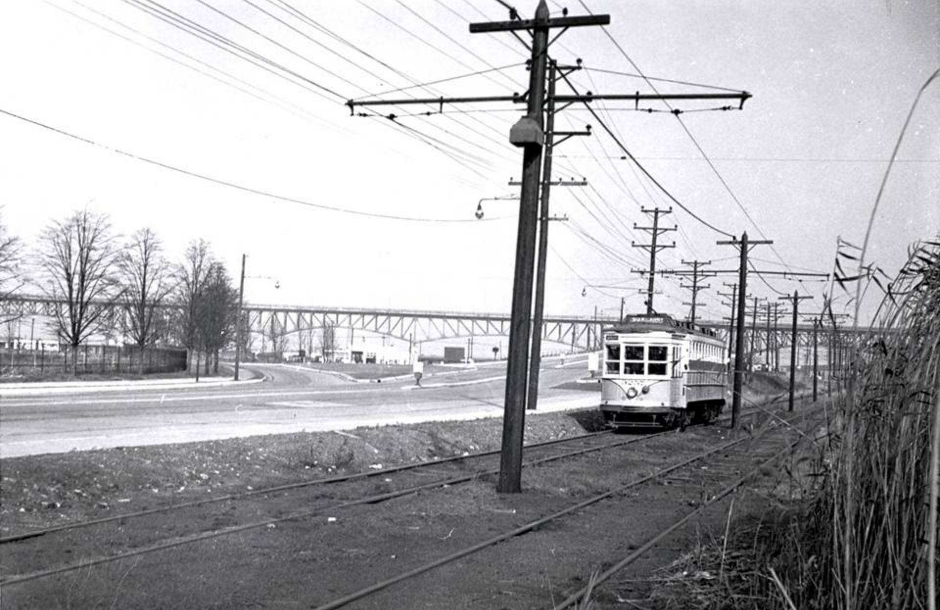
PSNJ 3257 South Kearny Line, South Kearny, NJ - PRW east side of Central Ave. Kearny facing north - Skyway in rear. The bridge left of trolley car is existing Central Ave. bridge over US 1&9 Truck.