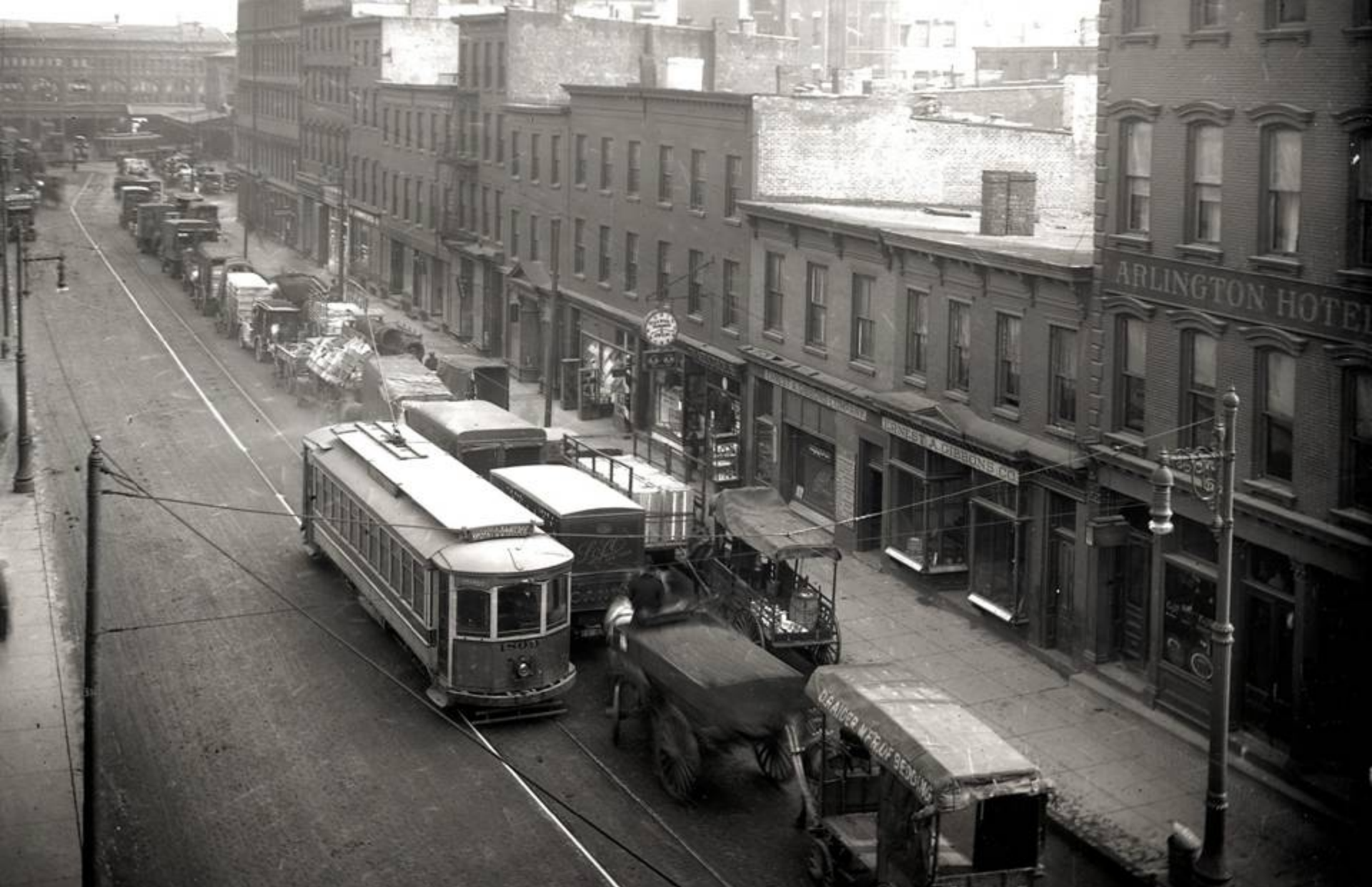
PSNJ 1809 PRR FERRY EXCHANGE PLACE JERSEY CITY,N.J. Montgomery Street and Greene St. facing east. The Arlington Hotel building amazingly still exists - its the only building that wasn't demolished for 101 Hudson Street - s.e. corner Montgomery & Greene (31-Montgomery St). Nothing else you can see in this photo still exists.