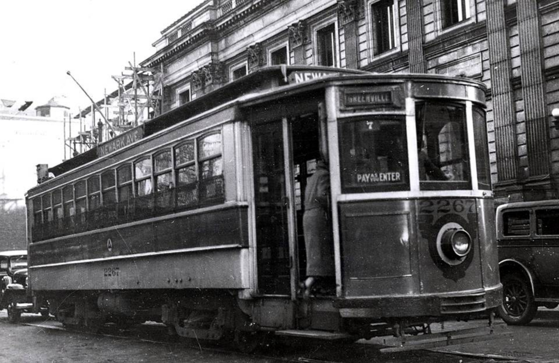
PSNJ_2267 JERSEY_CITY_N_J_November 27, 1933- Corner Montgomery and Washington facing east down Montgomery. Jersey City main post office is the fancy building.