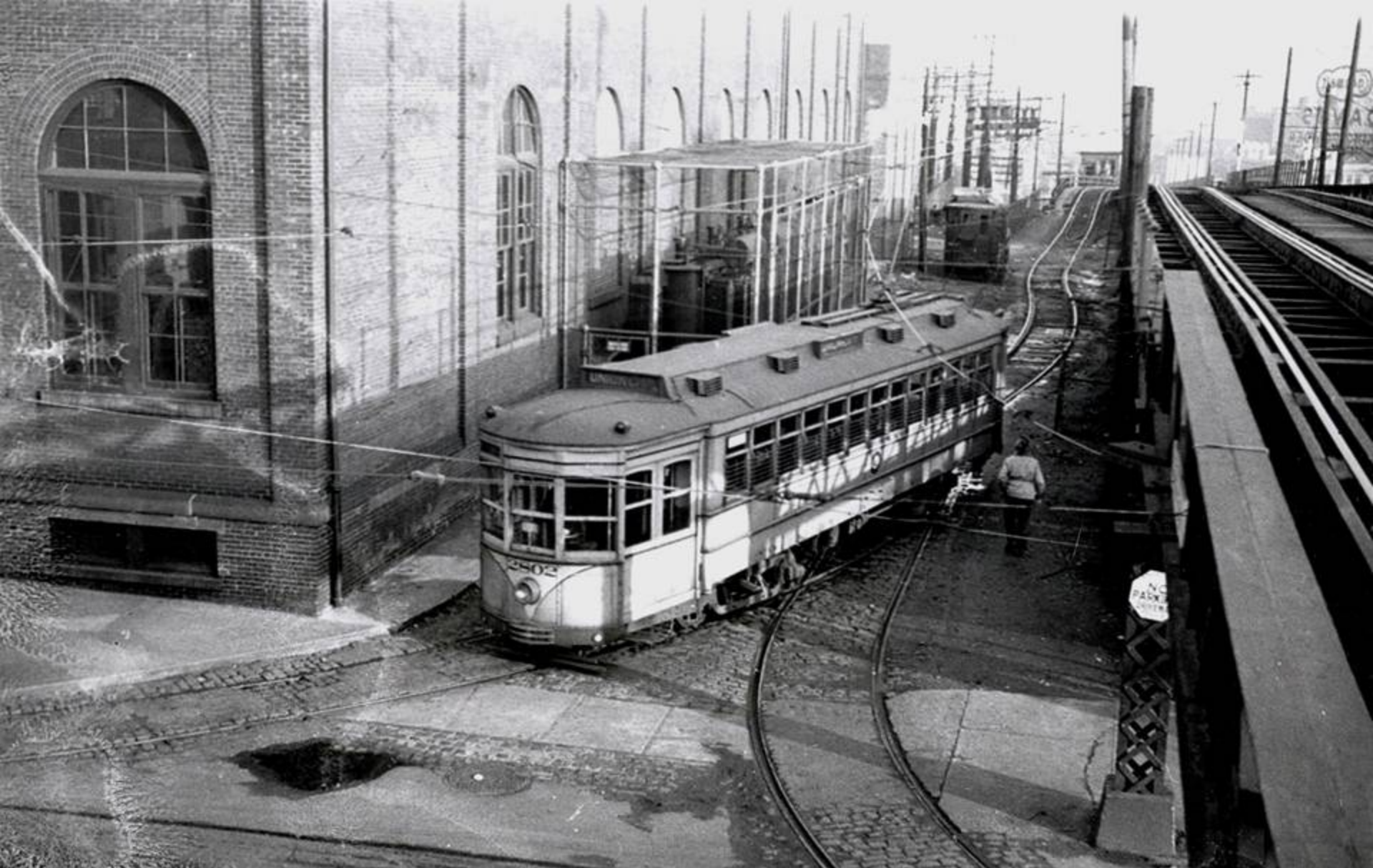
PSNJ 2802 LEAVING HOBOKEN ELEVATED UNION CITY LINE. Palisade Avenue facing east (basically we are looking at the top of the big Hoboken-JC incline). Building with arch windows still exists on east side of Palisade between Ferry and Ravine.