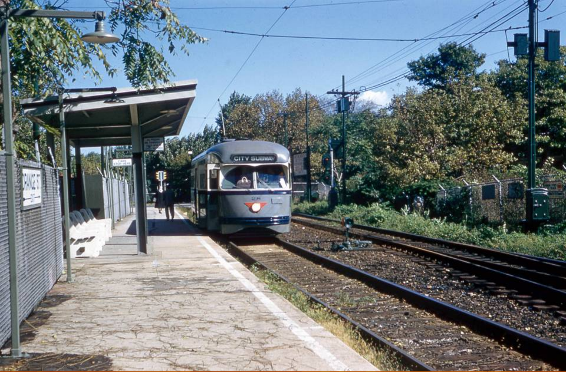
PSCT 28 Orange St. Stop October 12, 1959