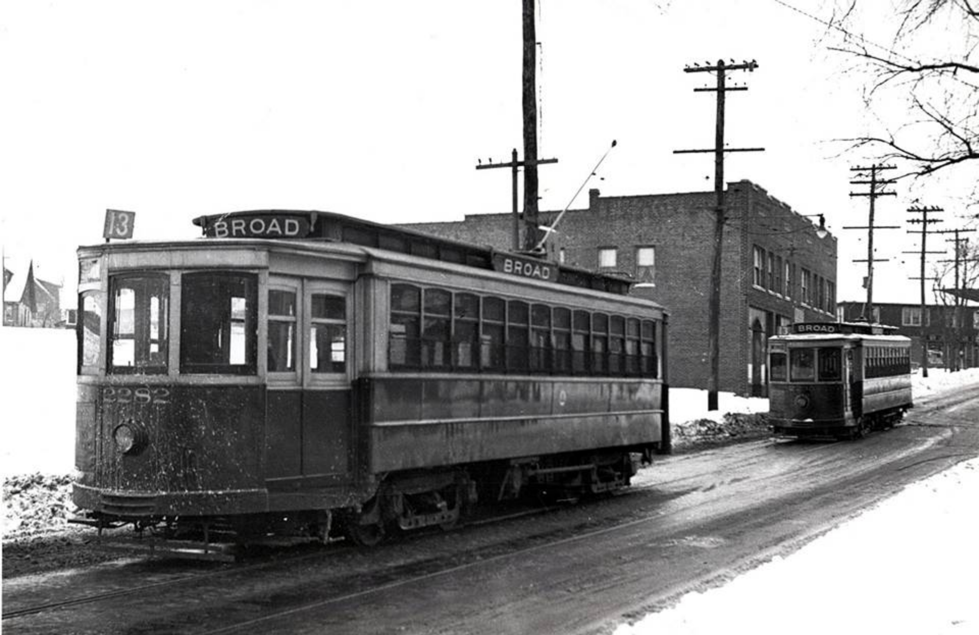
PSNJ 2282-223 MAIN Ave. GLENDALE St. NUTLEY,NJ February 11, 1936 - Main Ave is Passaic Ave. at this point, but otherwise confirmed. Facing south. Building behind 2nd car still exists.