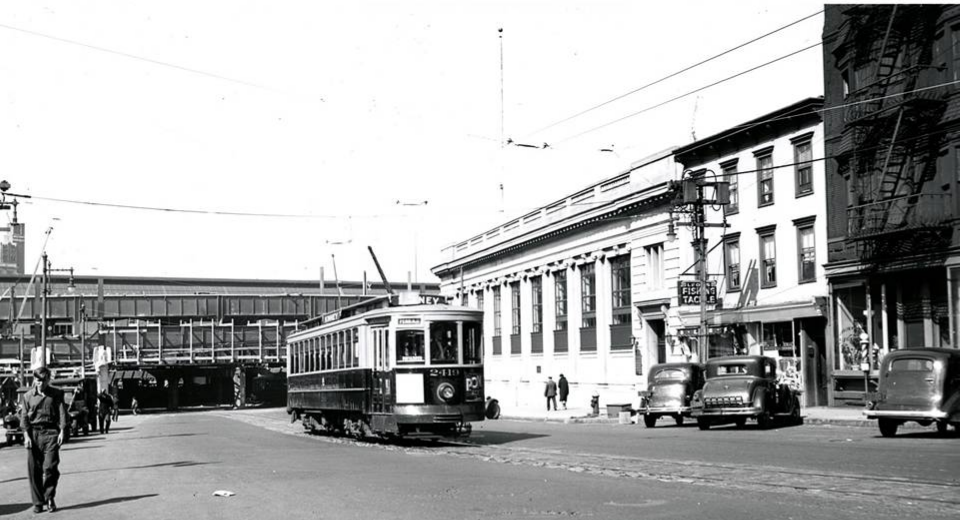
PSNJ 2419 Ferry Street near McWhorter St. Newark, NJ. Last day streetcar, October 3, 1936. Ferry St. facing west - Newark Pennsylvania Station under construction! Fancy building right of trolley still exists.