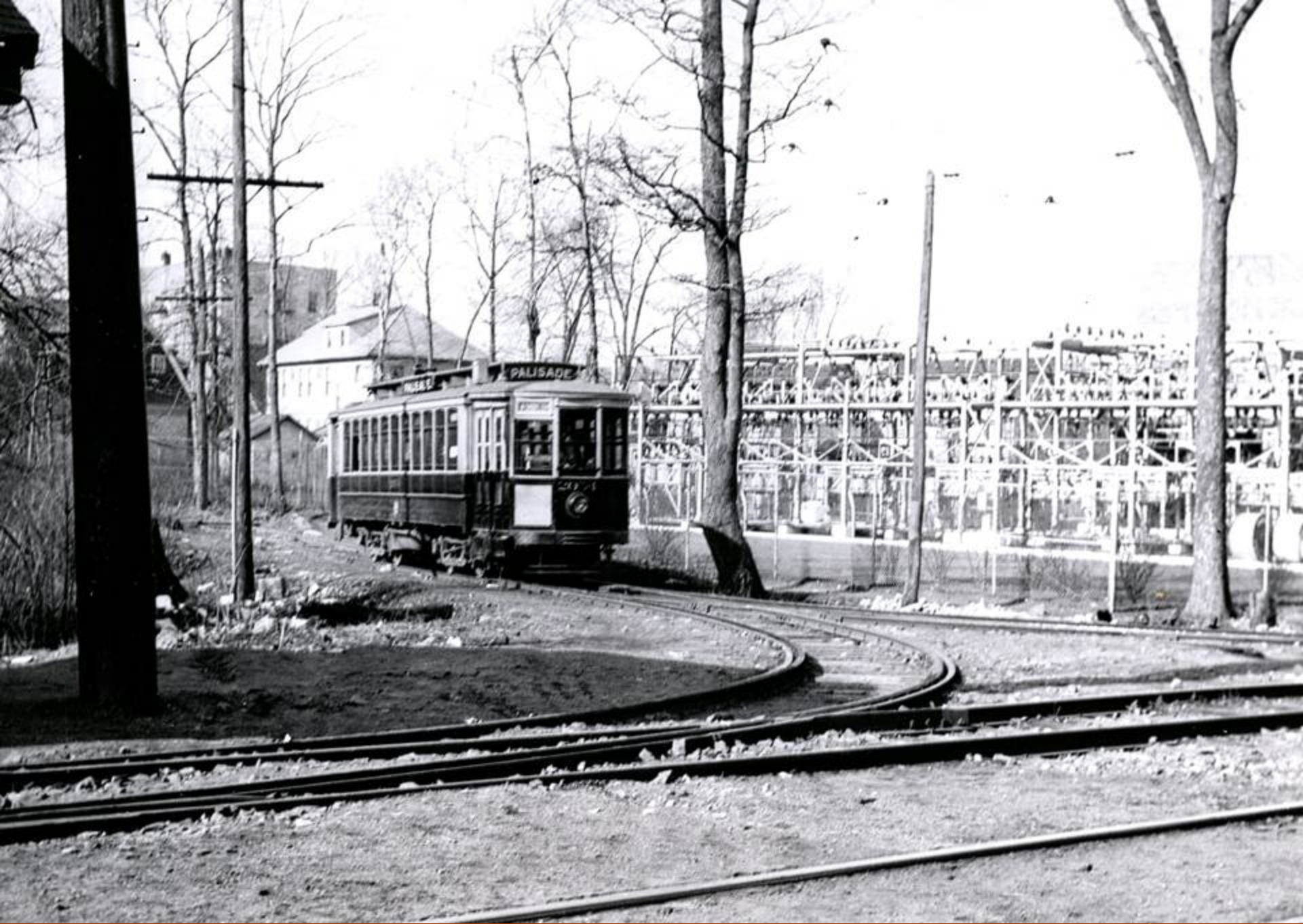
PSNJ 2054 in wye just south of Palisades Junction