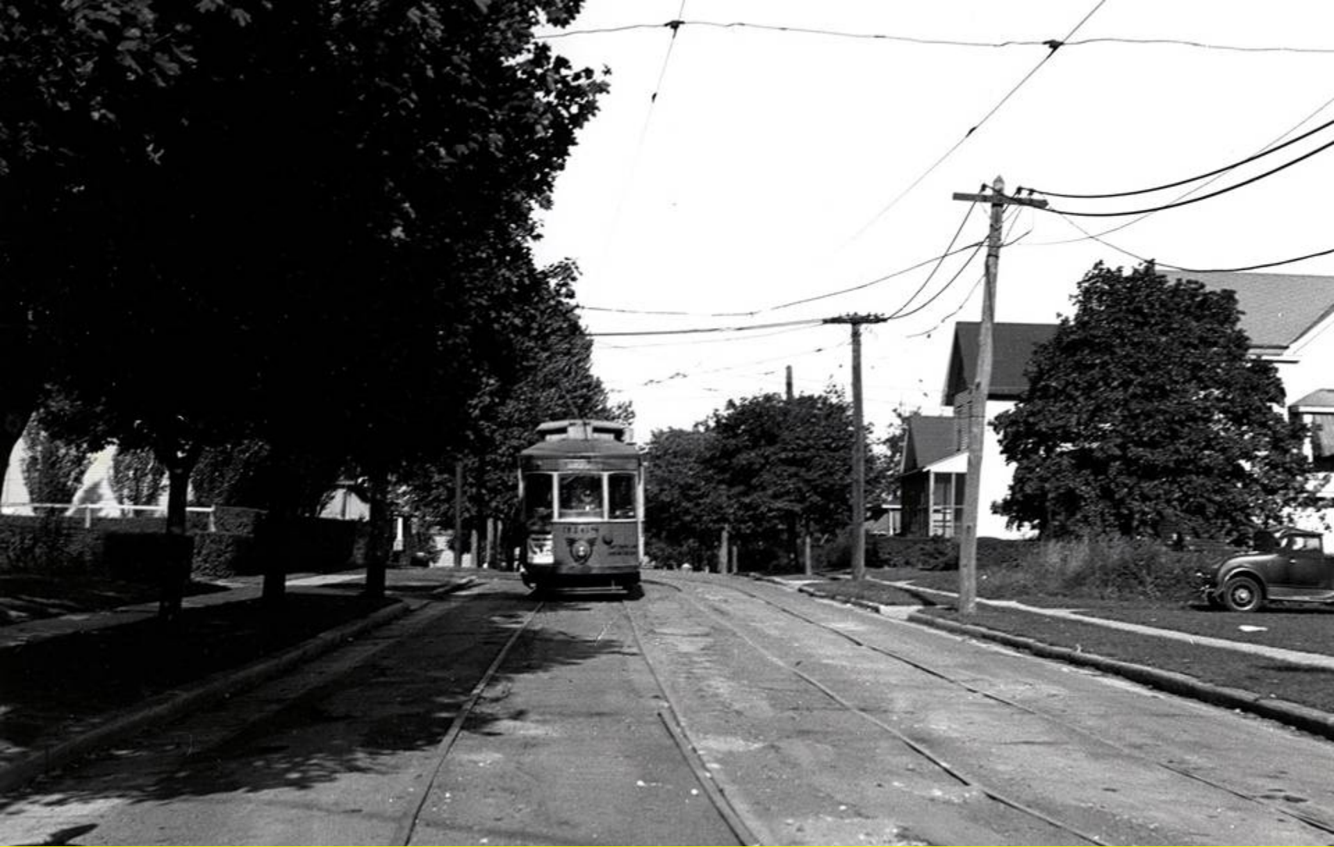
PSNJ 3168 Oaklyn, NJ October 4, 1935